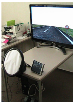
Fig. 1: Simulator setup.

CARS is an open source, low-cost, PC-based driving simulator. The system requires a consumer PC, a game steering wheel, a brake-and-gas-pedal gaming device, at least one display (monitor or projector), see Figure 1. The setup shows a 47” display which renders the road and environment, steering wheel and pedals and an additional, 8” display (secondary display) for the speedometer. The simulator shows a road with roadside markers and grassland in 3D. The driver controls the car by using the steering wheel and the pedals. CARS is designed to support the early stages of a development process for in-car systems by providing a concrete basis for making design decisions. So far CARS does not provide an absolute and proven measure of real driver distraction. Further tests and comparisons with a high-fidelity driving simulators or field tests will be needed to provide calibration for real driver distraction. CARS consists of three main components: a map editor for creating the route according to specific requirements with different street elements, speed limit signs, etc., the driving simulation tool and an analysis tool for calculating driver’s performance.