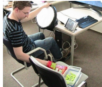
Fig. 4: Participant busy with secondary task

We conducted a second study to verify the significance of the distraction factor, based on the same physical setup. T1 was the same as in the previous study. In T2 participants had to answer questions like "Which city is closer to city A: city B or C?" by referring to a paper road map of Germany (placed on the front passenger's seat). 9 people completed the study. Analyzing the driving performance we have evidence that T2 is more distractive than T1.