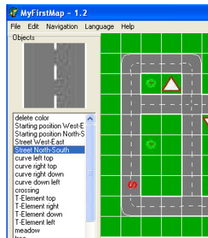
Fig. 2: Map editor's GUI.