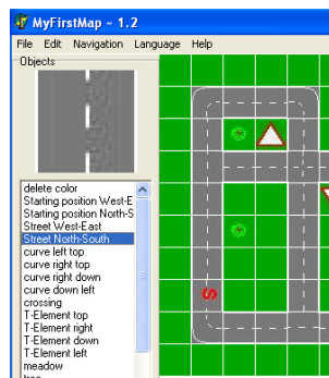
Fig. 2: Map editor's GUI.