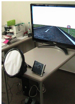
Fig. 1: Simulator setup.

CARS is an open source, low-cost, PC-based driving simulator. The system requires a consumer PC, a game steering wheel, a brake-and-gas-pedal gaming device, at least one display (monitor or projector), see Figure 1. The setup shows a 47" display which renders the road and environment, steering wheel and pedals and an additional, 8" display (secondary display) for the speedometer. The simulator shows a road with roadside markers and grassland in 3D. The driver controls the car by using the steering wheel and the pedals. CARS is designed to support the early stages of a development process for in-car systems by providing a concrete basis for making design decisions. So far CARS does not provide an absolute and proven measure of real driver distraction. Further tests and comparisons with a high-fidelity driving simulators or field tests will be needed to provide calibration for real driver distraction. CARS consists of three main components: a map editor for creating the route according to specific requirements with different street elements, speed limit signs, etc., the driving simulation tool and an analysis tool for calculating driver's performance.