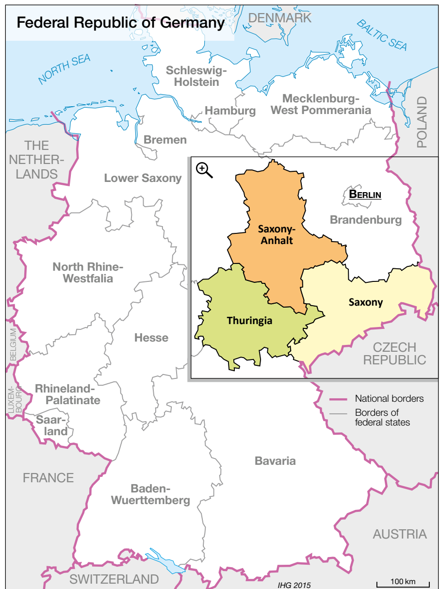
Fig. 1: Federal Republic of Germany

regularly communicate about developments and consequences of demographic change, for example at ministerial level, to exploit synergies and to increase the potential for common solutions. The objectives of this initiative are summarised in a joint statement: “Key Issues for the Cooperation of Central Germany States: Shaping Demographic Change Together” ( Eckpunktepapier zur Zusammenarbeit der mitteldeutschen Länder: Gemeinsam den demografischen Wandel gestalten ). The main goal of the dialog is the regular exchange of knowledge and experiences at all administrative levels to systematically increase the potential for mutual le-