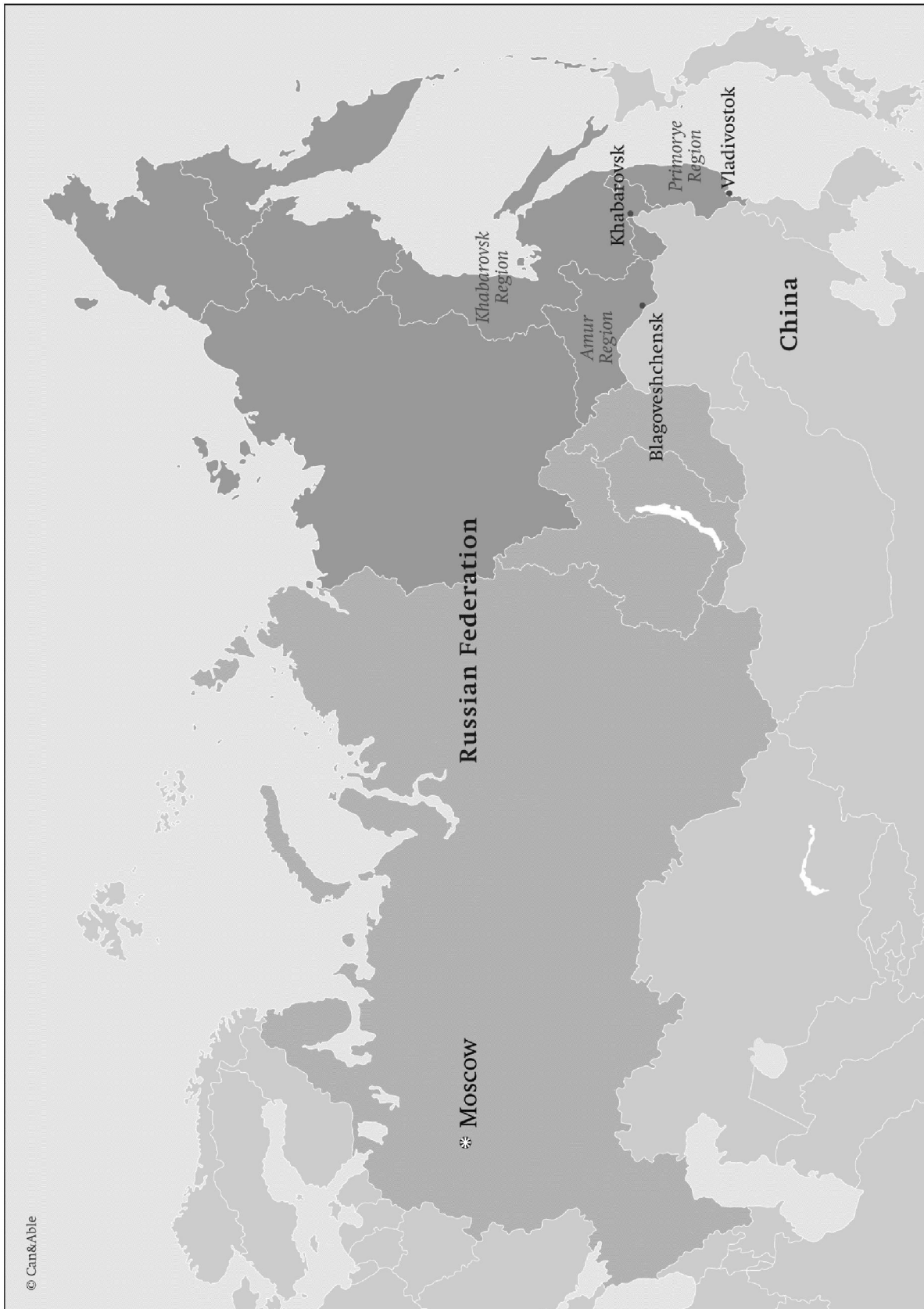
Map: Russia's Far East