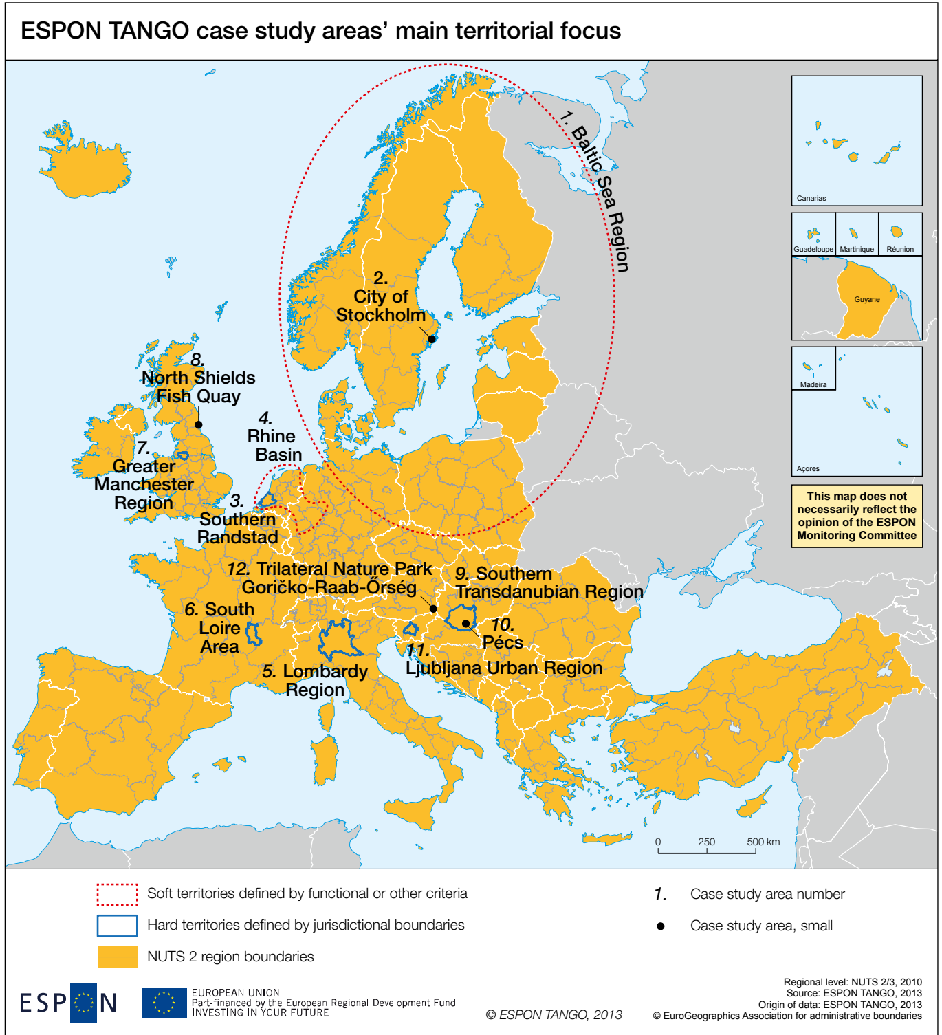
Map: ESPON TANGO case study areas' main territorial focus