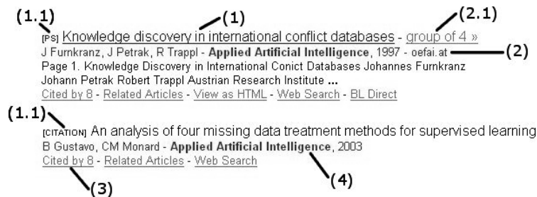
Figure 3. Two typical records of a Google Scholar result