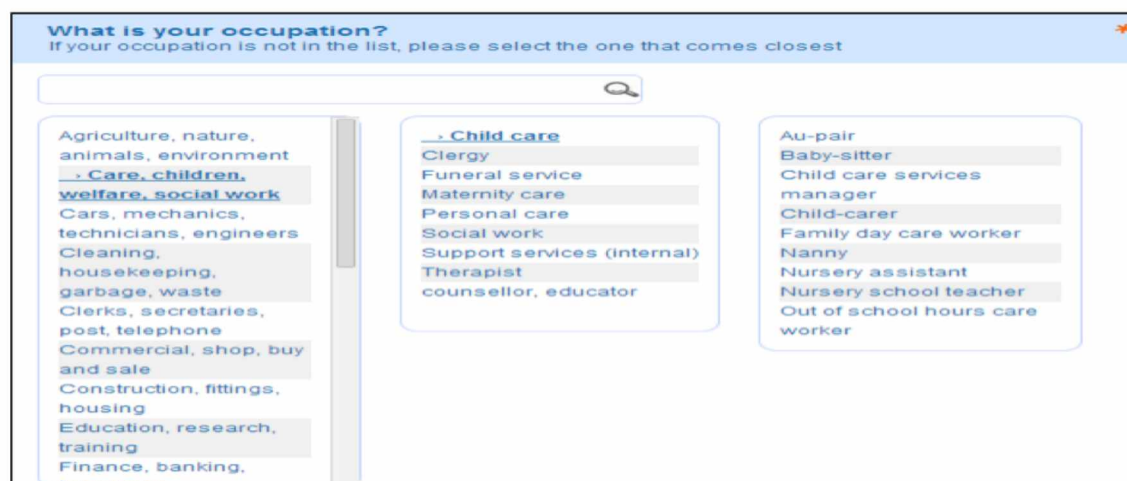
Figure 1 Three level search tree in the WageIndicator web survey for Great Britain