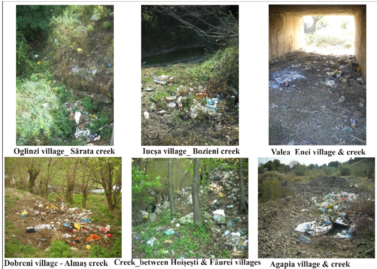
Fig. 1. Waste dumping in small rivers – field observations 2009-2011

Torrents valleys in the vicinity of the villages are susceptible to waste disposal such as Bro teni, B hni oara (Bahna commune), Nistria (Boghicea commune), Avere ti (Ion Creang commune) etc. In other localities the streams are often exposed to uncontrolled waste disposal where waste collection services are rudimentary or missing (as shown in fig.2), but performing a quantitative analysis can be achieved only under certain conditions listed above.