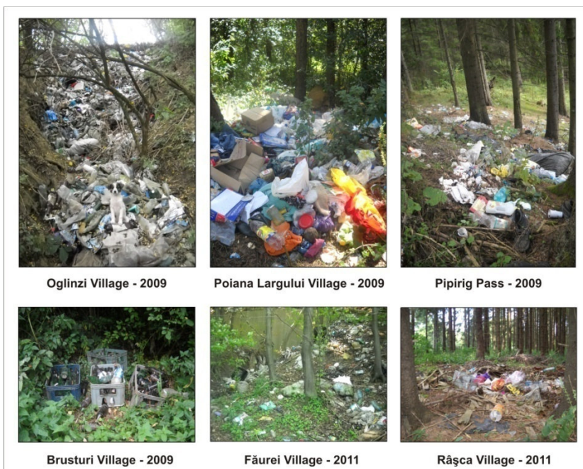
Figure 2 Waste dumping in forest areas - field observations

In the Carpathian areas, near settlements Râșca, Boroaia, Mălini, one can see forest areas affected by visible aesthetic degradation. Because of proximity to rural settlements, the rivers and tributary streams from mountain region are more vulnerable to waste pollution. Most of the waste generated and uncollected is partially recovered in households, and remaining waste is disposed in open dumps (Apostol and Mihai, 2011).