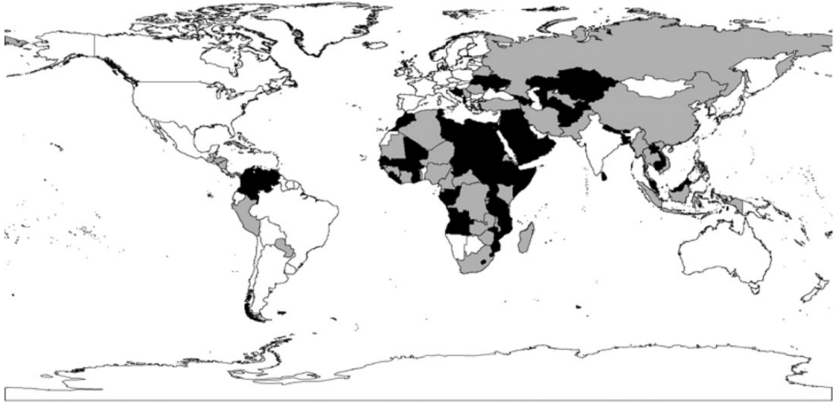
Figure 1. Map of authoritarian states and imposed democratic sanctions

White countries have been democracies for most of the period 1990–2010; black-colored countries were autocracies for most of the period but have not been subjected to democratic sanctions; grey countries are autocracies that were subjected to democratic sanctions for at least one year of the observed period. Classifications according to Wahman, Teorell & Hadenius (2013).