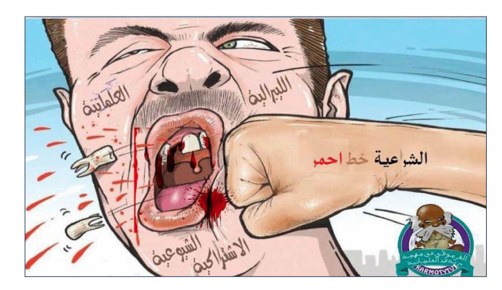
Caricature published on an Islamist satirical Facebook site. Text on the hand reads: »[Electoral] legitimacy is the red line«. Text on the face that gets beaten up reads: »Liberalism; secularism; communism; socialism«. Images and social media posts like this often were copied into anti-Brotherhood media that used them as proof of the inherently violent nature of their opponents.

(Verkaaik 2004: 140) Verkaaik argues that notions of ethnic purity alone do not lead to violence. Most of the time, people with mutually antagonistic visions of purity live in peace. But when violent confrontation occurs, such notions become real in action, and people involved sense that the truth is revealed, that things are clear and certain. Following Verkaaik's argument, I suggest that the ideological polarisation and power struggle of different movements and institutions did not as such result in the escalation of violence unleashed in the summer of 2013. The expectation of bloodshed grew and became concrete because it was accompanied by an assertive mood of broken fear and by repeated events of bloodshed, providing more and more certainty and clarity about the upcoming decisive battle.