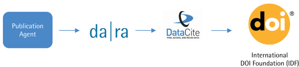
Figure 1: Metadata delivery

You can become a publication agent with the Registration Agency for Social and Economic Data da|ra. da|ra is a member of DataCite and sends a part of the delivered metadata to DataCite. DataCite is a member of the International DOI Foundation (IDF) and one of a handful of registration agencies (e. g. also CrossRef) which have the authority to allocate DOI names. It is the only agency that focuses on identifiers for research data. da|ra has the authority to allocate DataCite DOI prefixes to its publication agents.