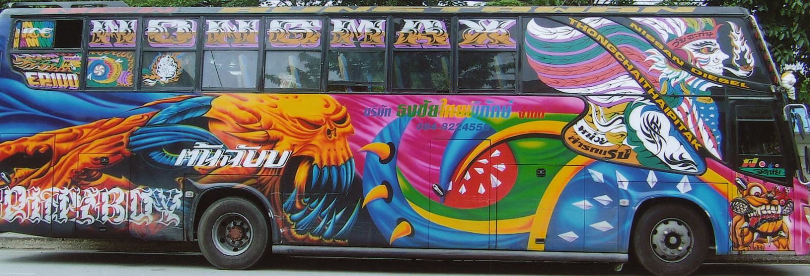
PHOTO 1: Smoking Indian and ghost-like monster on a comprehensively painted bus (2012)