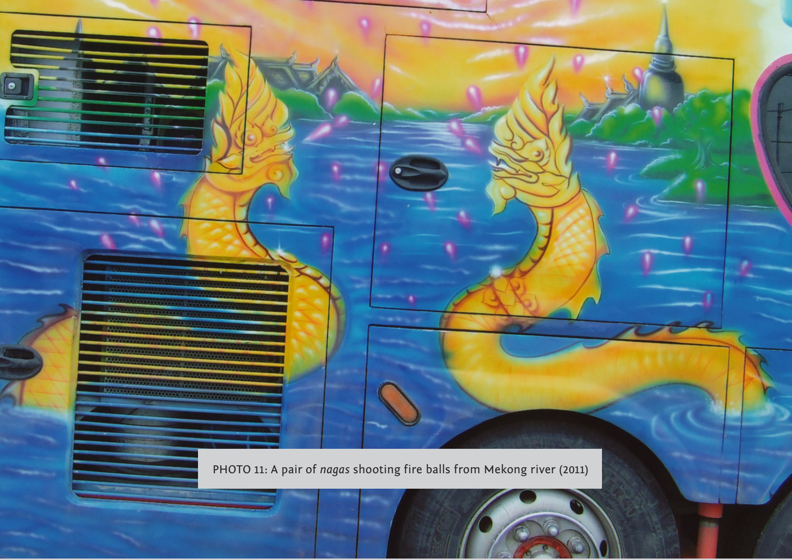
PHOTO 11: A pair of nagas shooting fire balls from Mekong river (2011)