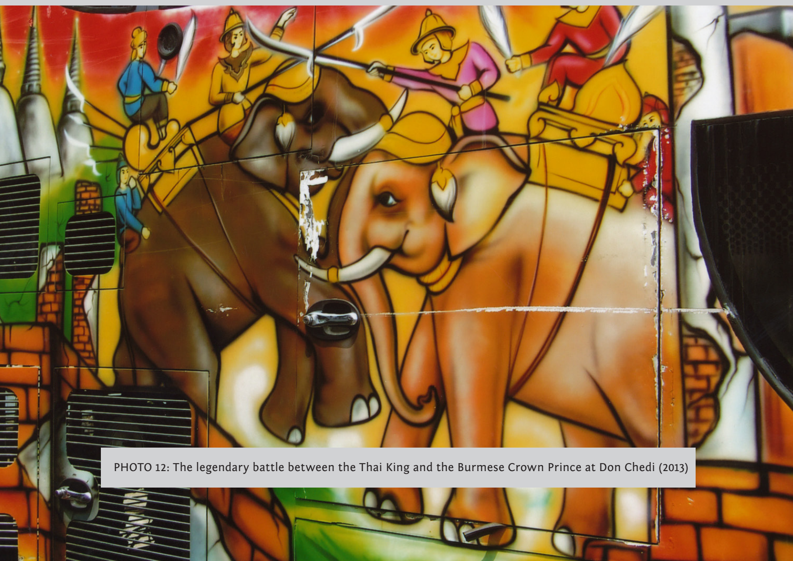
PHOTO 12: The legendary battle between the Thai King and the Burmese Crown Prince at Don Chedi (2013)