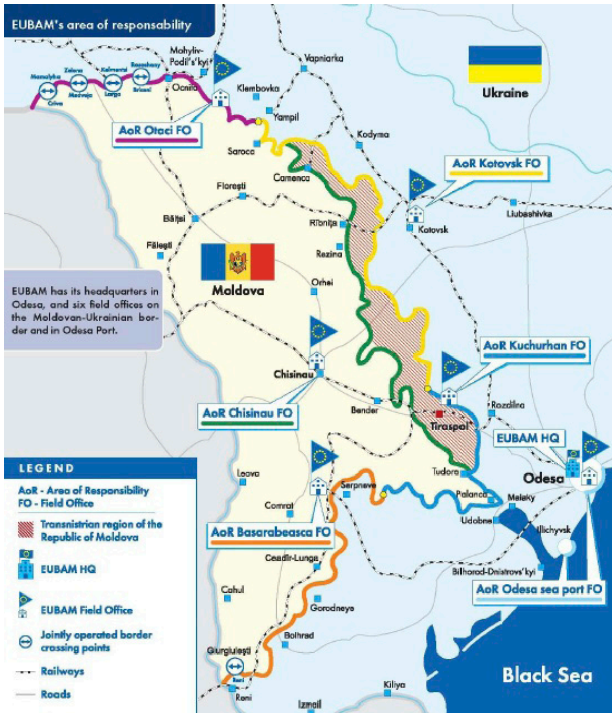
Figure 4: EU presence in Transnistria. http://www.enpi-info.eu/img/publications/eubampresspack.jpg