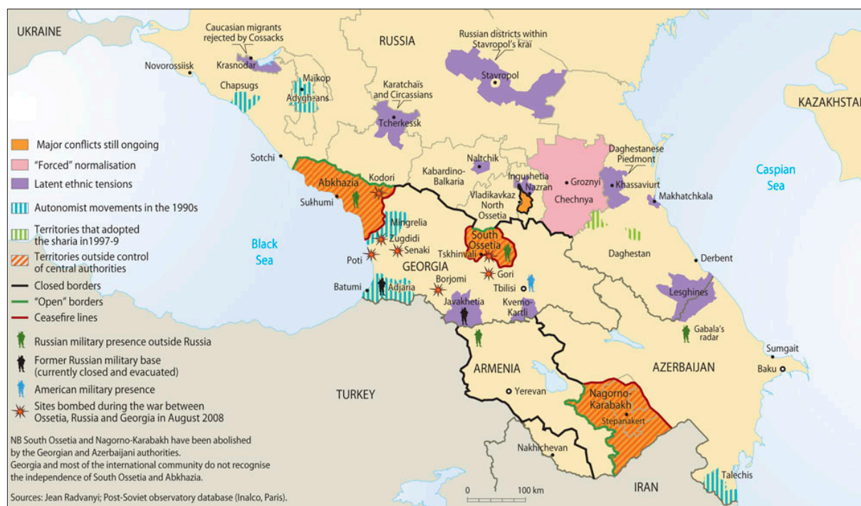
Figure 1: Geostrategic situation and the conflicts in the Caucasus region. http://mondediplo.com/maps/georgiawar

The Georgian-Russian war of August 2008 provides the best example of the wider geopolitical significance of the protracted conflicts