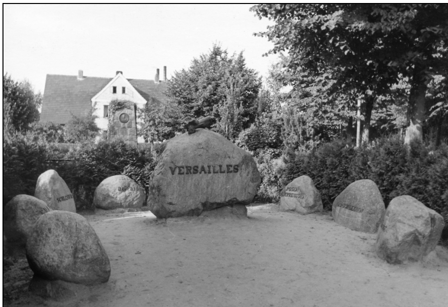
Fig. 1. The commemoration stone in Palminken (now the village of Yantarny) dedicated to the 1919 Treaty of Versailles, 1930s

the Treaties of Versailles and (1919) and Riga (1921) [1—3] unfair; and neither could not reconcile itself with the new status quo . Their apparent animosity towards the Second Polish Republic created a natural platform for cooperation and interaction in the world arena.