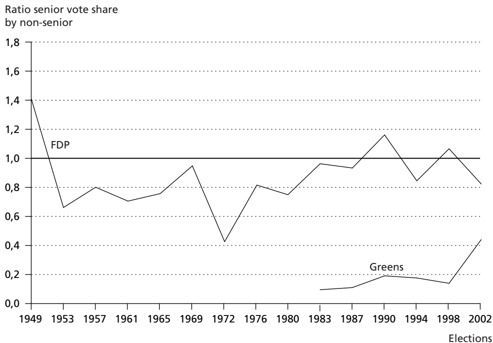
Figure 2 West German party ratios (vote share of voters aged 60 and older by vote share of those younger than 60) – FDP, Greens and other parties 1949–2002