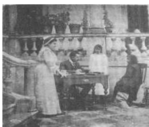
Medical-pedagogical inspection – The medical examination of children. Bulletin of Public Instruction and Fine Arts, Mexico, 1909, Biblioteca Lerdo

Photography and its impact on society in Mexico City at the turn of the nineteenth century has only become a subject of study in recent decades. The incorporation of photography in illustrated magazines and the modern sensationalist press at the close of the nineteenth century produced a notable renewal of graphical language with a considerable impact on people's mental habits, attitudes and beliefs. Newspapers and magazines devoted large photographic spreads to a variety of topics related to childhood, through which some of the new ideas on childhood received wide circulation, including topics related to criminology, medicine and education. The qualitative change in printing enabled the modern press – whose prototype was the newspaper El Imparcial and the magazine The World Illustrated – to cast its influence over a new type of reader and user much more diverse and heterogeneous than that reached by the political press of the second half of the nineteenth century.