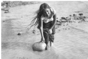
Girl collecting water in the lake, Winfield Scott, Chapala, Mexico, 1909