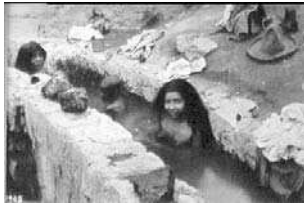
Poor girls taking a bath, Charles B. Waite, Mexico City, 1901, Private Collection