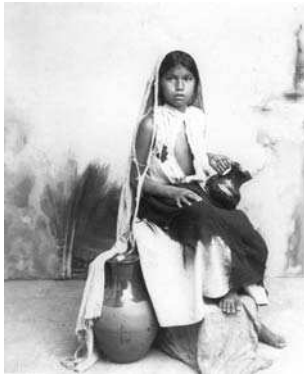
Girl posing with a pitcher

child psychology, together with the rise and spread of photography in the printed media, provided people with a previously nonexistent imaginary related to the definition and representation of these issues.