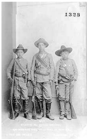
Child revolutionaries in northern Mexico, 1911, Gutierrez Heliodoro, Private Col.

One of the potential threads for this cultural reflection on childhood consists in the use of images which change and recycle the meanings of childhood, providing different contexts for their reading. Examples of these singular transformations can be found in cartes de visite , the nota roja (sensationalist press) and crime tabloids, in studio portraits with the clinical view of physicians and educators, or in the blend of the civic with the religious in the photograph of a first communion labelled as an example of patriotism. All these are singular cases, but not exceptions; rather they illustrate a repeated tendency which needs to be taken into account in reading and interpretation of representations of this type.