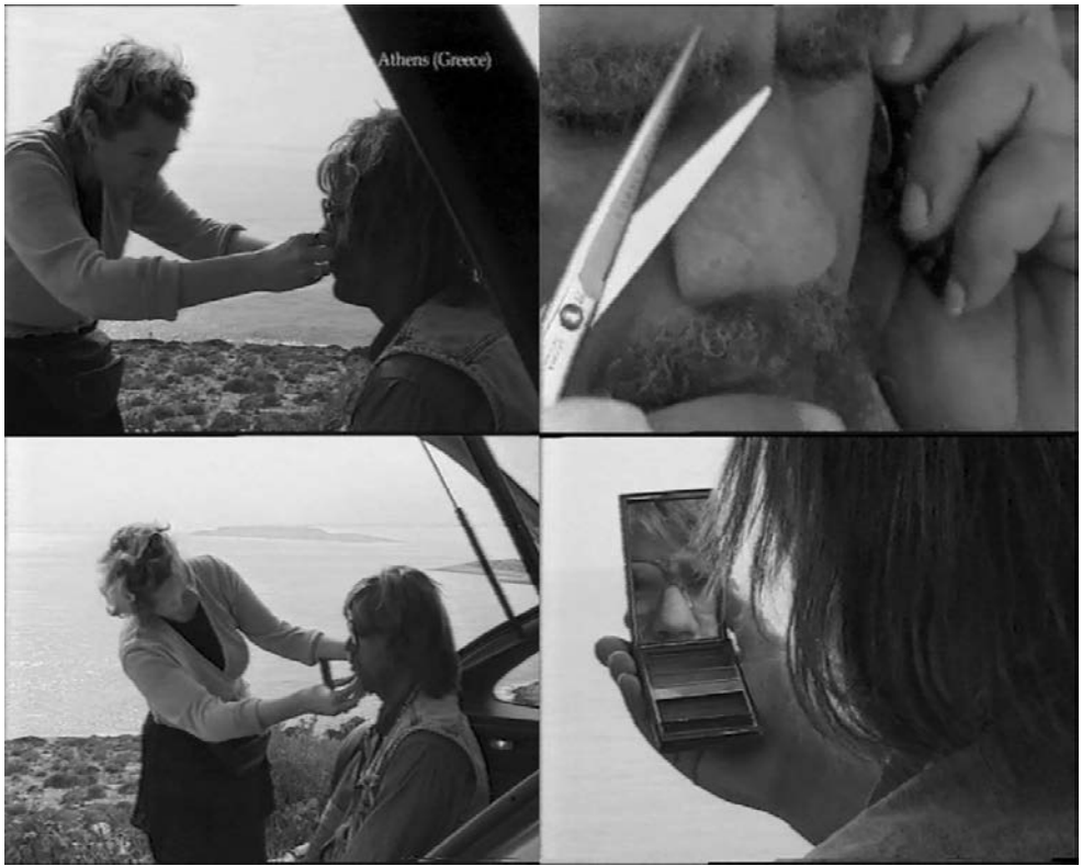
Figure 5: Passagères clandestines , Belgium/France, 2004