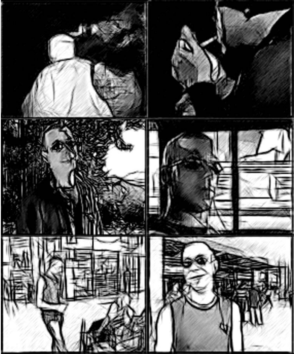
Figure 1: Schattenmenschen , Germany, 2007 8