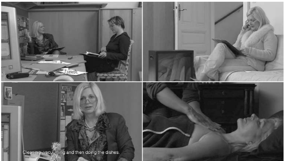
Figure 7: Kurz davor ist es passiert , Austria, 2006

Every event that documentary film pretends to represent always happened “just before” we can see its image on a screen. Instead of the illusion of sharing the migrant's perspective for a moment in film, Salomonowitz disturbs the spectator and forces her or him to double-read the film. The images represent their protagonists' daily life and they sharpen the viewer's sense for what is invisible in this representation and in all our ordinary daily life as well. Film becomes no longer a medium of recognition but of cognition. The evacuation of the migrants' bodies from the images is the price Salomonowitz has to pay for showing the invisibility. However, it is not only a price to pay, but opens up new perspectives beyond the un-