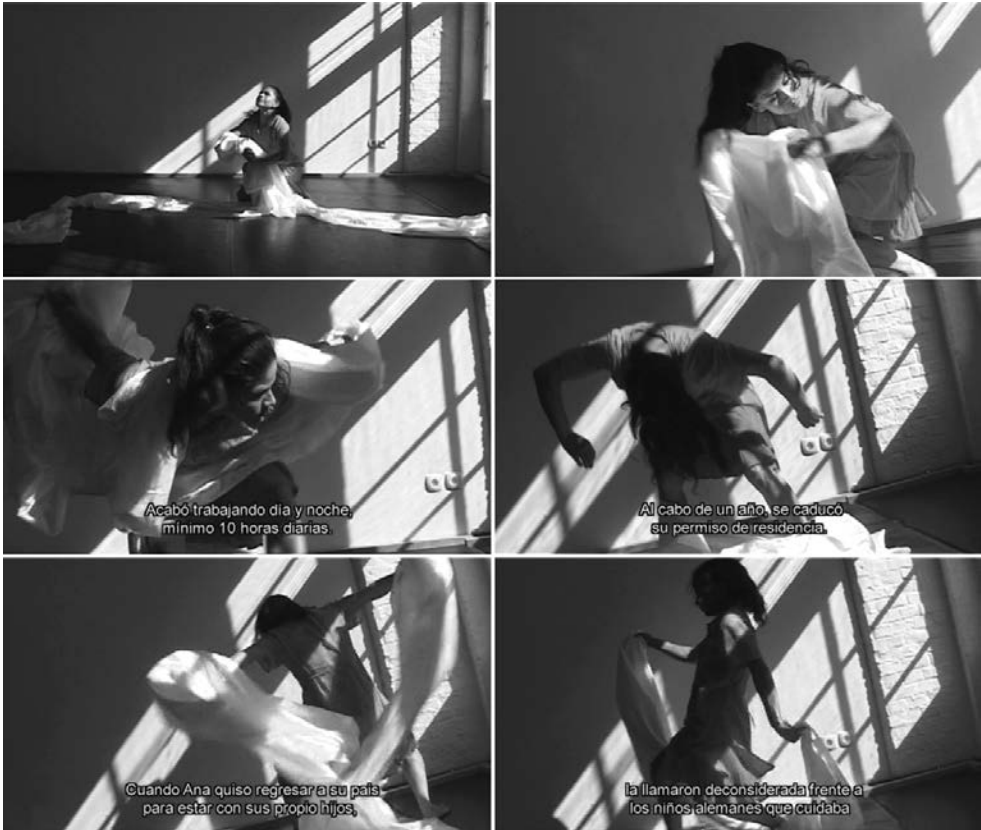
Figure 6: Mit einem Lächeln auf den Lippen , Germany, 2008