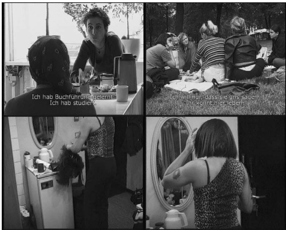
Figure 4: Otras vías , Germany 2003

In another scene, one of the migrant sex workers is shown in front of a mirror while dressing up as a transvestite. It appears probable—as in the case of the domestic worker who cleans the flat in Haus-Halt-Hilfe —that the viewer is standing behind the person who is dressing himself up. The camera position has definitely something voyeuristic, but the migrant, while shown from the back, clearly communicates through his movements towards the