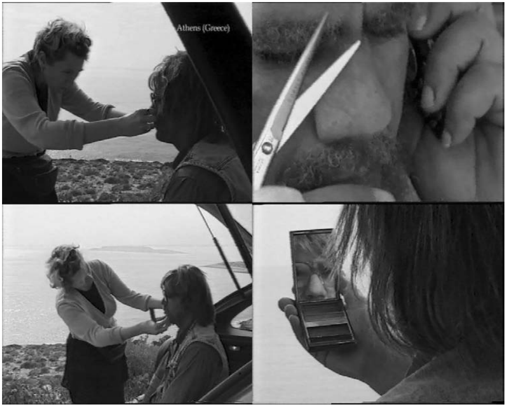
Figure 5: Passagères clandestines , Belgium/France, 2004