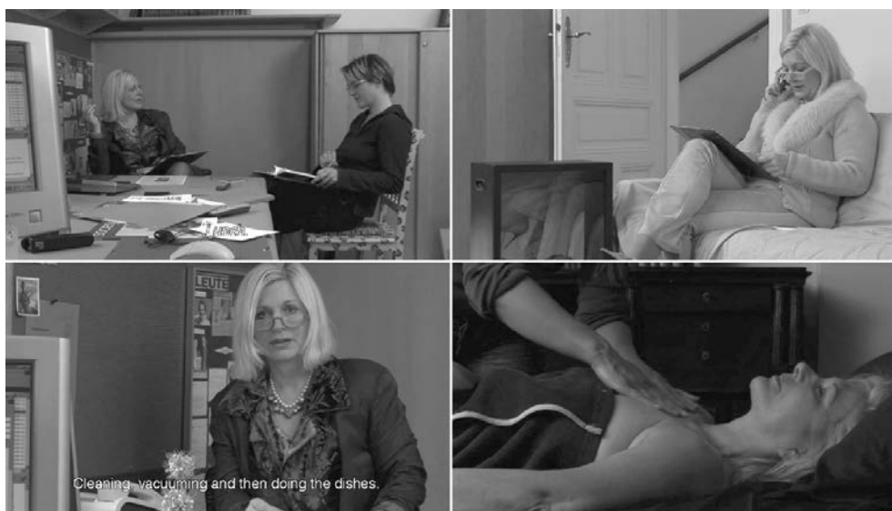
Figure 7: Kurz davor ist es passiert , Austria, 2006

Every event that documentary film pretends to represent always happened “just before” we can see its image on a screen. Instead of the illusion of sharing the migrant's perspective for a moment in film, Salomonowitz disturbs the spectator and forces her or him to double-read the film. The images represent their protagonists' daily life and they sharpen the viewer's sense for what is invisible in this representation and in all our ordinary daily life as well. Film becomes no longer a medium of recognition but of cognition. The evacuation of the migrants' bodies from the images is the price Salomonowitz has to pay for showing the invisibility. However, it is not only a price to pay, but opens up new perspectives beyond the un-