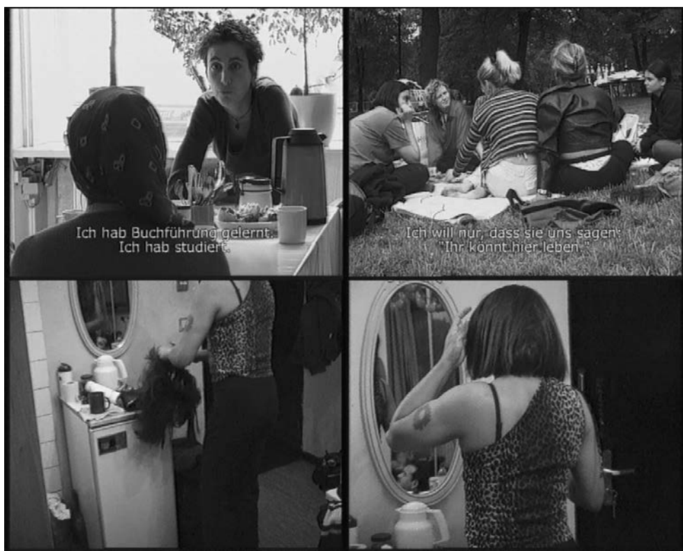
Figure 4: Otras vías , Germany 2003

In another scene, one of the migrant sex workers is shown in front of a mirror while dressing up as a transvestite. It appears probable—as in the case of the domestic worker who cleans the flat in Haus-Halt-Hilfe —that the viewer is standing behind the person who is dressing himself up. The camera position has definitely something voyeuristic, but the migrant, while shown from the back, clearly communicates through his movements towards the