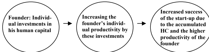
Figure 2: The human capital approach in the context of entrepreneurship