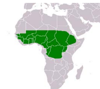
Map 1: Distribution of Shea nut tree (Vitellaria paradoxa)