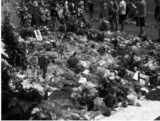
Temporary memorial created in April 2007 at Virginia Tech University, Blacksburg, VA.

scrapbook photographs to annual civic celebrations such as Cinco de Mayo and July 4th in the United States to Remembrance of the Dead in the Netherlands, an annual commemoration (on May 4) of Dutch losses in warfare.