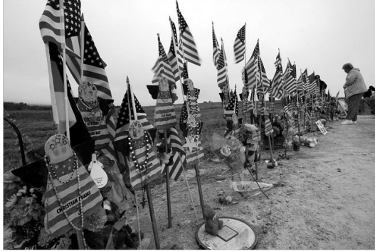
Temporary memorial (photo taken in 2005) created in memory of United Flight 93 and 9/11, Shanksville, PA.

including tribal and community traditions, the struggles of slavery and civil rights, and the recollected experiences of incarceration on federal reservations or in World War II internment camps.