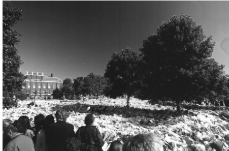
Temporary memorials to Princess Diana in front of Kensington Palace, London, September 1997.