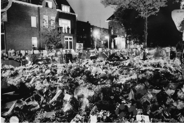
A sea of flowers, objects and documents in front of Pim Fortuyn's residence, May 2002.

tions: places and spaces to be visited. Fixed commemorative sites such as the Lincoln Memorial (Washington, D.C.) and the National Monument on the Dam (Amsterdam) are mostly sites to visit and look at, although they may also host annual rites of remembrance and other public ceremonies. Temporary memorials, however, originate as performative gestures of audience engagement. People bring things to temporary memorials, not only making them but also orchestrating their affective conditions. They walk through and around them; they read the cards and poems that are left; they kneel down to caress the other things that have been brought; they photograph and videotape what they see; they cry; they are physically and emotionally moved – affected – on multiple levels.