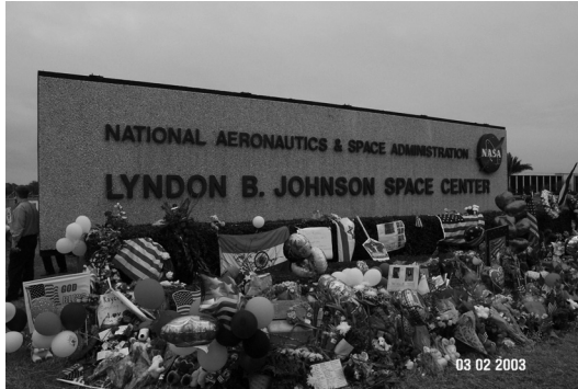
Temporary memorial made following the Columbia Space Shuttle Disaster, Lyndon B. Johnson Space Center, Houston, TX, 2003.

The victim dies and the spectators share in what his death reveals. This is what religious historians call the element of sacredness. This sacredness is the revelation of continuity through the death of a discontinuous being to those who watch it as a solemn rite. A violent death disrupts the creature's discontinuity; what remains, what the tense onlookers experience in the succeeding silence, is the continuity of all with which the victim is now one. Only a spectacular killing... has the power to reveal what normally escapes notice. 58