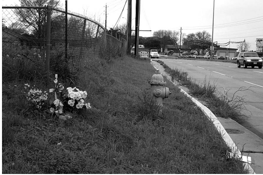
Roadside memorial erected in 2003, Austin, TX.

We have eradicated many previously fatal diseases and control others with medical technology. Infant mortality rates have plunged while adult life expectancy has surged. We have developed automobile air bags, emergency response systems, warning devices, and safety standards for nearly everything that could put our lives at risk. Even our risk of dying in war has been reduced by strategies such as airstrikes rather than deployment of ground troops. We have gained such control over death that we now expect to die only of old age. 63