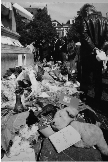
Temporary memorial for the murdered Dutch politician Pim Fortuyn, created at the basement of the statue of the father of the nation, William the Silent († 1584), May 2002.

If wildly divergent in subject and style – few of today's memorials hold to the classicizing sentiments of earlier generations – these commemorative sites collectively represent what I call ‘memorial mania’: the contemporary obsession with issues of memory and history and an urgent, excessive desire to express, or claim, those issues in visibly public contexts. 3 Contemporary acts, rituals, or performances of memorialization are often exorbitant, frenzied, and extreme – or manic. Their pathos and inconstancy are not surprising: memory itself is often unpredictable and unstable, and rituals of memorialization are often prompted by emotional states of being such as grief, guilt, and gratitude. Furthermore, contemporary modes of commem-