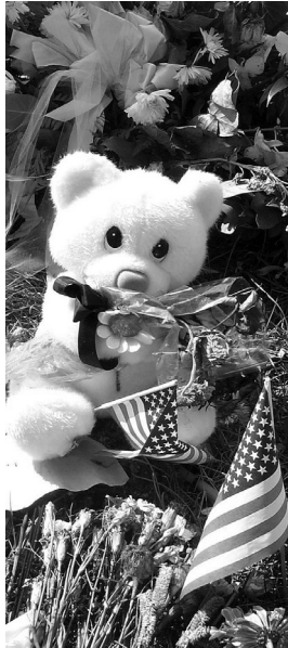
Temporary memorial created in September 2001 featuring a teddy bear and flowers at the Pentagon, Arlington, VA.

Visitors brought bouquets of flowers, candles, cards, and a copy of the Torah, signed their names in the two public comment books that the museum provided, and posed for photos in front of the display. Collecting and displaying such space shuttle shrine material – called ‘grief’s memorabilia’ by staffers – has now become part of the museum’s curatorial agenda. 29