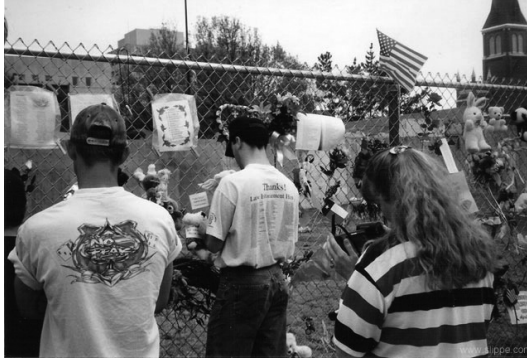
Items being added to the Memory Fence, Oklahoma City, OK, in 1999.