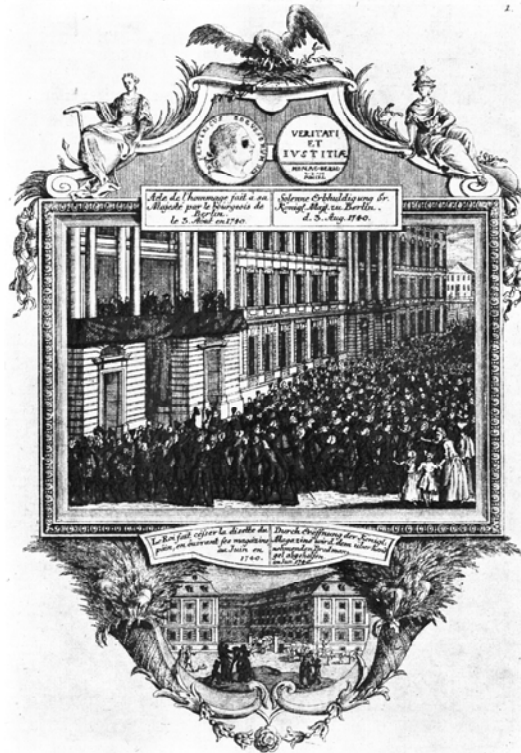
In: Schultz 1988, 44.

Their biggest challenge, though, was still to come. In 1770 a sharp winter with snow that lasted until June followed by catastrophic rainfall destroyed crops all over central Europe. 20 What ensued has been branded by Borussophile historiography as an “immensely successful fight against famine”, “an example of superior social policy” 21 that transformed Prussia into “an island of security” 22 , thereby following the assessment of Frederick II in his famous ‘political testament’: