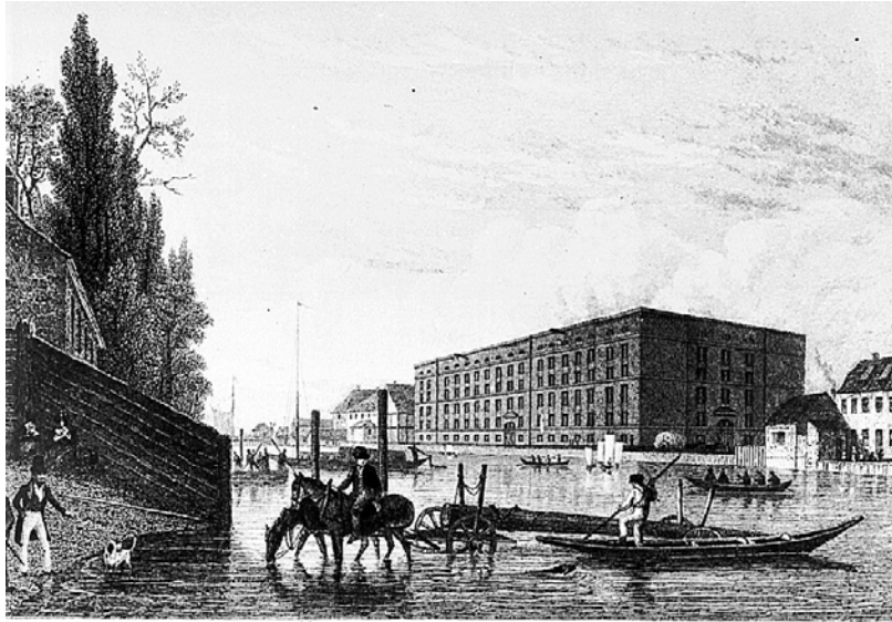
Engraving by T. Barber.

At the height of the crisis the price of grain almost tripled, a disaster for a population that regularly spent two-thirds of their income on food. It resulted in a serious rise in deaths from starvation, exhaustion and disease as well as a significantly reduced rate of marriages and offspring. Indeed, fear and desperation had become so widespread that even two average harvests in 1773 and 1774 failed to improve the situation. Many countrymen anxiously held onto their food, leading to a renewed wave of accusations against suspected “Jewish mischief”. 34