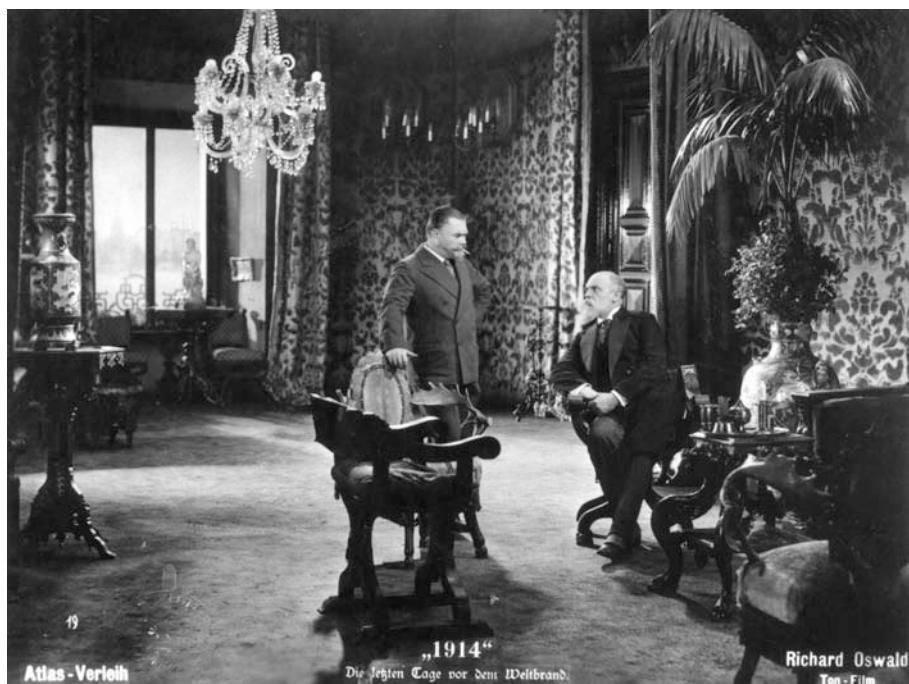
A conversation between Sasonow (standing) and a foreign diplomat

nationality, the main characters nearly all the time move about in the same recognisable rooms. For example, Franz Joseph can always be seen sitting at a desk in a spacious room, with two high windows that filter the sunlight. We see German Chancellor Bethmann-Hollweg (Albert Bassermann) in a small, sparsely decorated room with a desk that is large yet simple, and with bookcases covering the walls. The French government leaders move in a room dominated by Napoleon's buste. However, the most striking rooms are those of the Russians. Czar Nicholas II (Reinhold Schünzel) moves almost without exception in an empire style room in his spacious and well-lit palace, containing few pieces of furniture but with ample decorations on walls and ceiling. The style and lighting contrast strongly with the dark room occupied by the Russian Foreign Minister, Sasonow (Oscar Homolka).