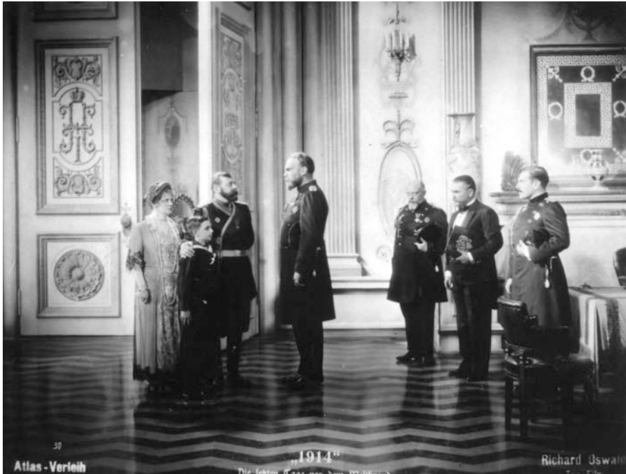
Grand duke Nicolai, the czar and the czarina

other locations, of Serbia, Great Britain and France, are also official rooms, but they are contrasted far less sharply than the above. The 'official spaces' are left only for the last scenes of the film, when we move to the shabby newsroom of the daily L'Humanité , with the portly figure of its founder, Dreyfussard, socialist and anti-war agitator Jean Jaurès (Heinrich George). After his murder in a restaurant, where he had just begun eating his entry, the last scene ends with the sound of church bells chiming.