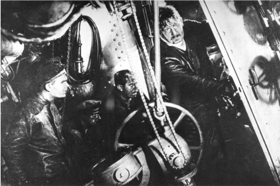
Captain Von Liers and two of his men in their submarine (MORGENROT)