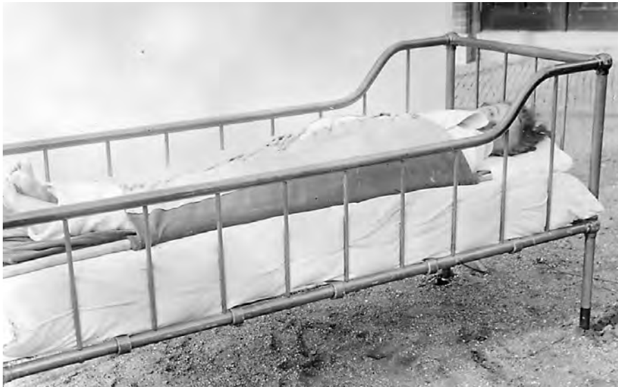
3. Patient in a hydrotherapeutic wet pack, Meerenberg Asylum, ca. 1900.

The therapeutic use of water has a long history in medical and psychiatric treatment. Warm or cold baths, sponge baths, and showers had been applied