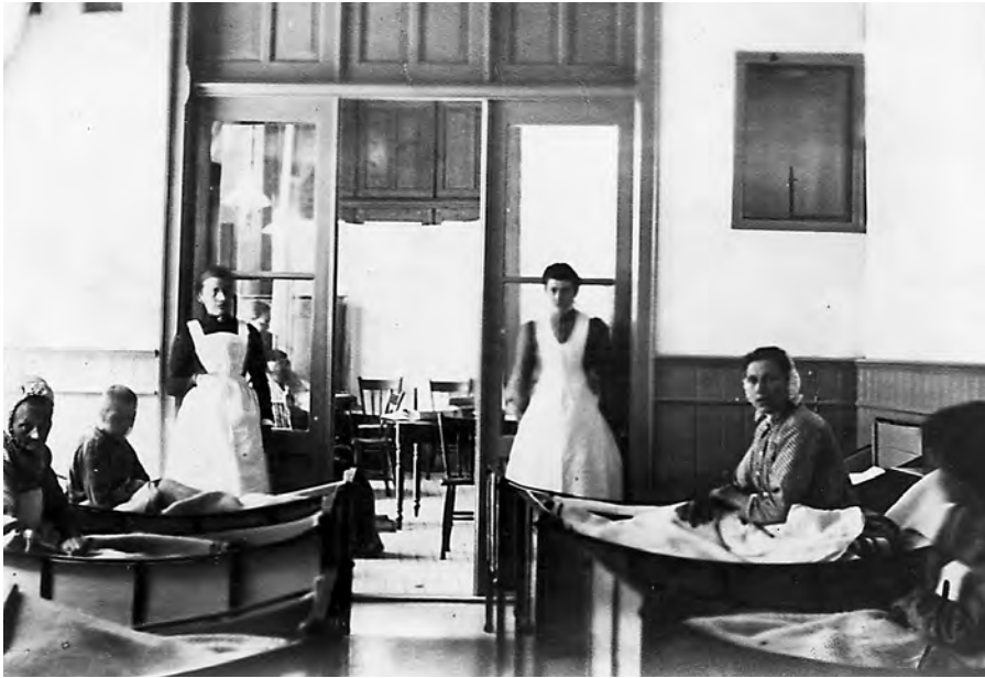
2. Patients on bed rest in the observation ward with two nurses. Female department at the Franeker Asylum, ca. 1900.

rooms as sick wards for bed rest. Likewise, bed rest was initiated in the wards on which disturbed patients were managed. In theory all patients could be treated with bed rest – including melancholic, manic, and disturbed patients as well as patients suffering from delirium or with epilepsy, paralysis, or imbecility – and thus remain on the ward rather than being put into isolation. According to Van Deventer, the antisocial behaviors diminished, and he also noted how traditional forms of coercion such as isolation in cells and the use of straitjackets and gloves were hardly used anymore. Single rooms were only used for very disturbed patients, preferably with an open door and only rarely in a final resort, did physicians order isolation in cells. 49