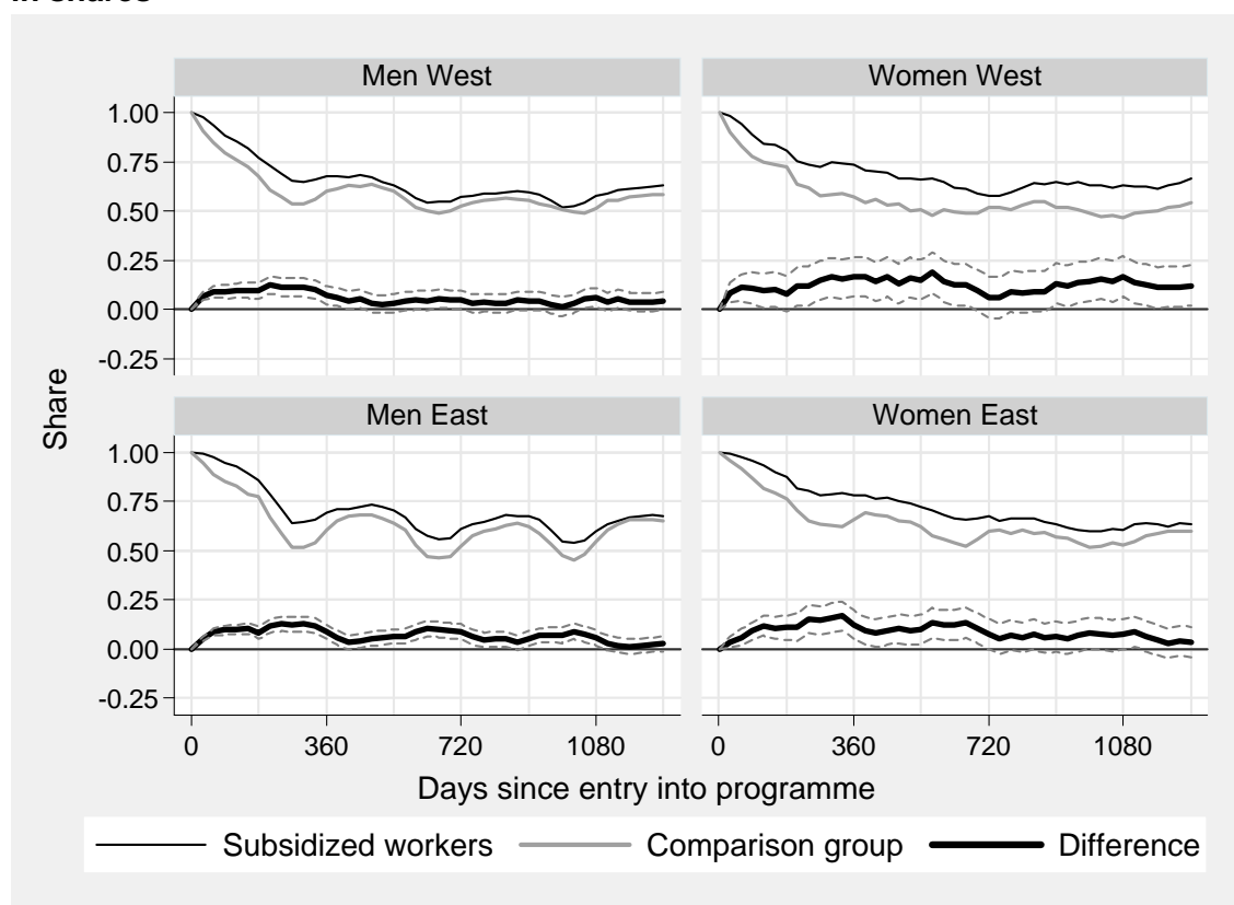
Figure 3 Only firms hiring subsidized and unsubsidized workers – Share of subsidized workers and matched comparison persons in employment as well as difference in shares

Note: Previously unemployed workers taking up a full-time job during the second quarter of 2003. Confidence intervals for the difference in shares are given for \alpha = 0.05 . Comparison persons have been selected by means of a radius matching and a caliper of 0.01. Subsidies include subsidies for training requirements as well as subsidies for hard-to-place workers. With the exception of the first subsidized employment spell, only times in unsubsidized employment are considered.