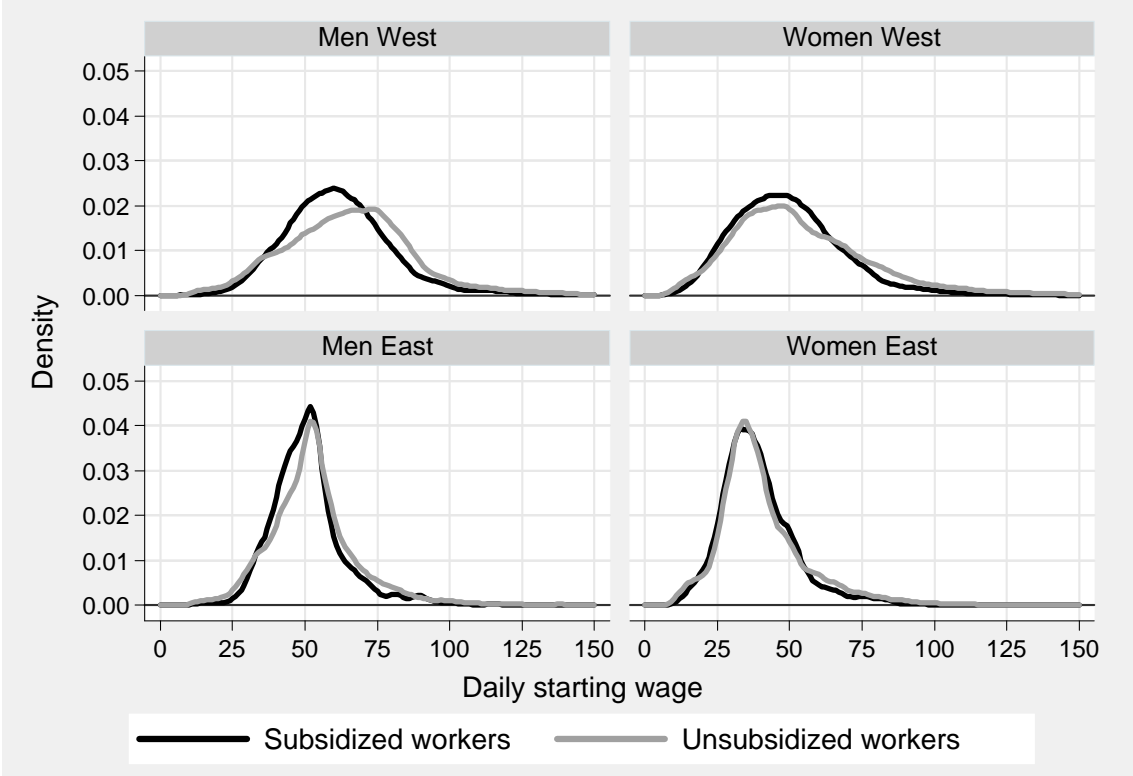
Figure 1 Full sample – Kernel estimates of the distributions of daily wages directly after taking up the job

Note: Previously unemployed workers taking up a full-time job during the second quarter of 2003. Subsidies include subsidies for training requirements as well as subsidies for hard-to-place workers.