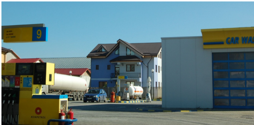
Fig. 2 Residential areas location near gas stations

Direct correlations (0.76) between residential area and the year of establishment of gas stations in Voluntari empirically demonstrate that since 2002 the location of these gas stations followed peripheral areas of residential districts. However, the demand for space for individual and collective dwellings has determined their establishment in the gas station proximity (Fig. 2), which led to combination of two functions difficult to be managed in terms of quality of the environment.