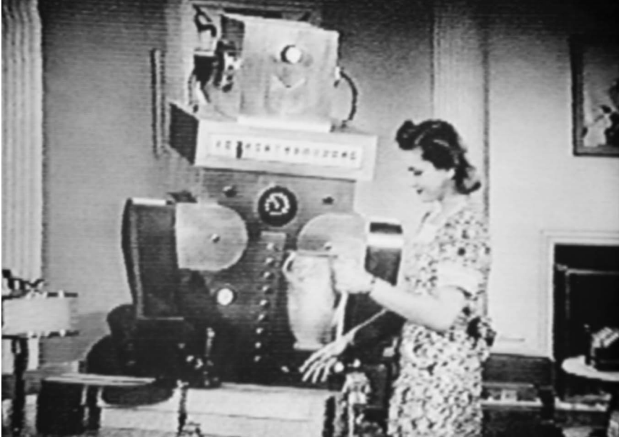
Figure 2 Roll-Oh helps around the house in the 1940 short film Leave It To Roll-Oh

1940s, Buckminster Fuller promoted his 'Dymaxion Dwelling Machine' (which was sold as a kit) as a do-it-yourself democratic dream house available at affordable prices. However, while American consumers were fascinated with futuristic homes, they did not necessarily want to live in the mass-produced and strange looking places imagined by Fuller, Le Corbusier, Neutra and others. For the most part, as Brian Horrigan suggests, 'Americans did not want machines to live in; they wanted machines to live with' (1986: 157).