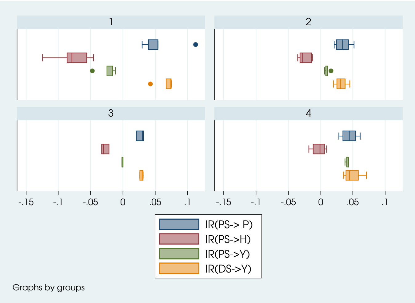
Figure 1: Box plots for the industry groupings as identified by the cluster analysis. The numbers on top of each plot correspond to the numbering of patterns in Table 4. PS= productivity shock, DS= demand shock, P= productivity, H= hours, Y= output growth. Industries 2 and 5 are omitted.