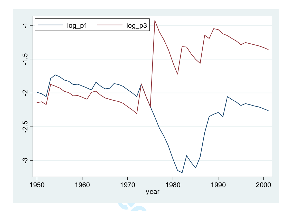
Figure 3. Modification in the price structure (logarithms)