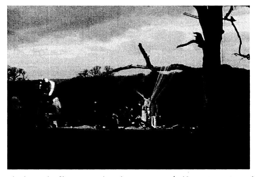
FIGURE 4 The Beatles filming at Knole Park, 30 January 1967

Managed by the National Trust, although owned by the Sackville-West family, Knole Park has a long and complex cultural history, especially over claims to its landscape. Pressure for public access increased with a series of carnivalesque acts of trespass in the later 19th century. In Virginia Woolf's experimental novella Orlando (1928), the park becomes one of Bloomsbury's bohemian landscapes, a shifting space—time tableau to affirm Woolf's literary friend Vita Sackville-West's claim to the estate, the story pivoting on the enduring symbol of an old oak tree on a rise in the park. The scenes for Strawberry Fields forever (Figures 4 and 5) are similarly transgressive and conservative. They are shot in wintry dusk and darkness on a hill known as Echo Mount, because it was a vantage point for listening to was known in Tudor times as the 'musicke' of the deer hunt—the baying hounds and thundering horses, the huntsmen's halloos and horns. Kettle drums are scattered on the slopes; a piano is strung with wires to an oak tree. The main sequence, alluding both to the tree symbol of the song and to its