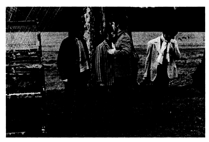
FIGURE 5 The Beatles 30 January 1967 at Knole Park, filming

reversed tape at the end, shows McCartney running backwards and leaping up onto a branch; as the record fades, the group daub the piano with paint.