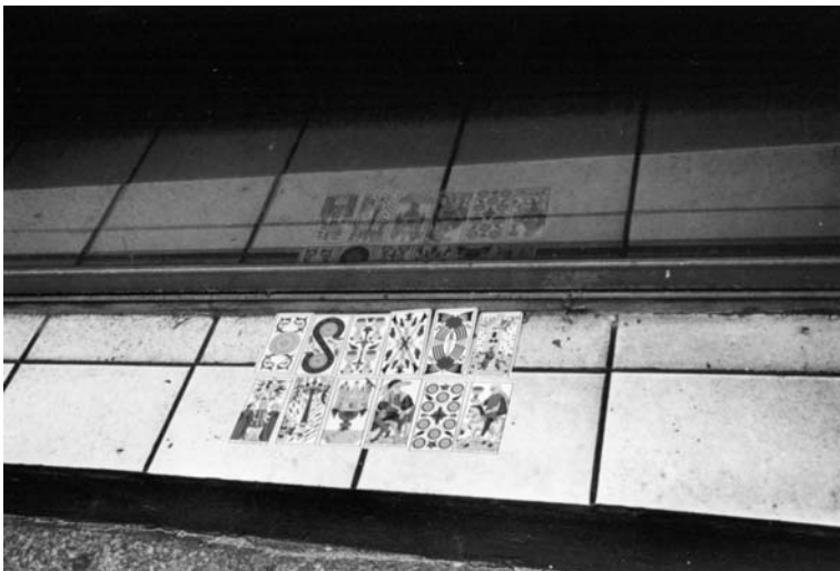
FIGURE 2 Twelve cards at the location of the 12th hour beneath the roots of the cork oak tree.

In the shop window beneath the emblem of the cork oak tree a red sign is displayed on which is printed in large letters the word WONDER. As we gather round to draw randomly 12 cards from a well-shuffled pack of tarot, and Le Goff arranges them on the step of the shop named WONDER (Figure 2), we comment on this sign; it is perhaps coincidence but suggests that the day is instilled with a sense of wonderment or the