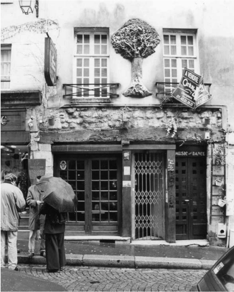
FIGURE 4 Six tarot cards at the location of the 6th hour beneath the roots of the old oak tree.

commodity tourism and, as Pinder suggests, ‘marked by the loss of an outside to capitalism’. 35 In this respect Le Goff’s intervention produces an alternative narrative of space that is subversive and countercultural; it is completely outside of capitalism and of that commodity culture which appears to hypnotize most the tourists and shoppers frequenting the centre of Paris. This resistant element of the intervention seemingly entangles it with relations of power. However, in constructing his interventions, Le Goff is not impelled by social or political concerns but by curiosity of place and creativity. Le Goff acquaints capitalism with a sense of the real that, he comments, ‘is not to be rejected even if it hurts. I like to be in the real, not in a materialistic sense, but because I believe that dream is utterly linked to reality. I don’t submit to reality but I try to model or moderate it’. 36 He is oblivious to the fact that his intervention challenges dominant models, perceiving it as offering a way of being in the world that is poetic and engages