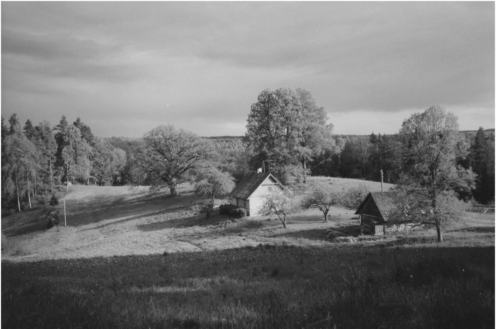
FIGURE 1 Latvian homestead

The agrarian nationalist discourse continued to be reproduced even under Soviet rule through official promotion of folklore and ethnic heritage, subsidization of a very large agricultural sector, semi-official tolerance of private plot farming and dissident practices such as a crypto-nationalist landscape protection movement. To this day, the dominant Latvian notion of national identity remains that of the 'nation of farmers'. As a Latvian sociologist puts it, 'it would be difficult to find another self-reference within Latvian culture that is as capacious and enduring' as that of the 'peasant culture' or 'nation of farmers'. 28 Likewise, the dominant construction of homeland remains the agrarian Heimat: a cultivated landscape of labour or ethnoscape (to borrow Anthony D. Smith's evocative term) that mutually constitutes and is constituted by the Latvian national character and serves as a reservoir of national history and ethnographic uniqueness. 29 Like the landscape of hedgerows and thatch-roofed villages for the English, for most Latvians this cultivated ethnoscape is indisputably the iconic Latvian landscape: a landscape of solitary farmsteads graced with majestic, carefully tended oaks and maples; of 'old country parks and arboretums, protected millponds, ... old field systems ... , winding roads and various other features created by human hands, which vividly demonstrate the history of the relationship between humans and nature' (see Figure 1). 30