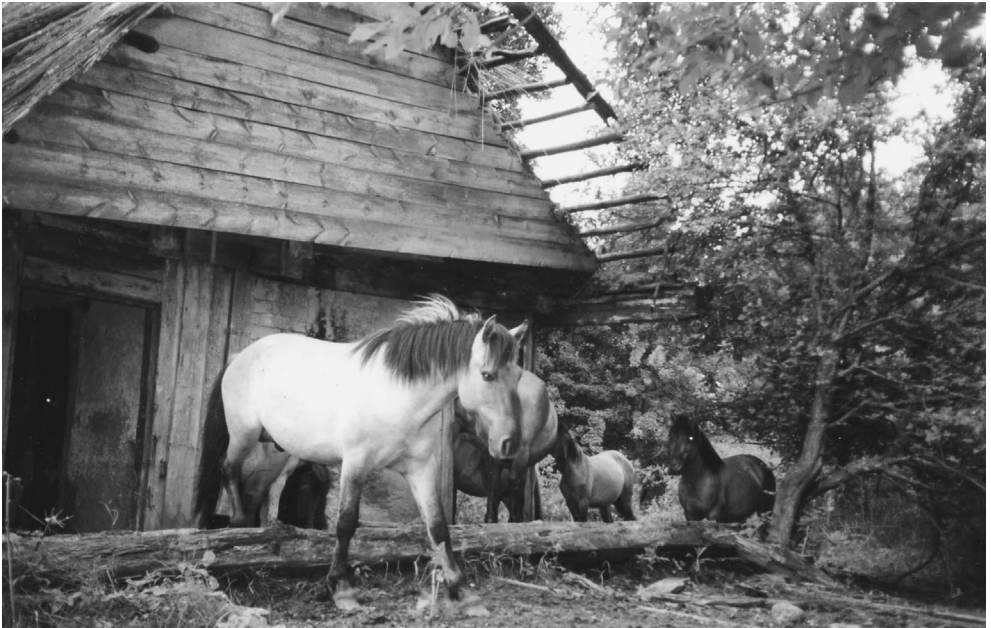
FIGURE 6 Konik horses at Lake Pape

The introduction of Konik horses was intended as the first step toward creating what the Dutch team called a ‘new wilderness’: ‘a large unbroken area where natural processes can take place with the least possible disturbances’. 44 Human activities – mowing, reed cultivation, manipulation of water levels – were to be kept to a minimum. Eventually the sluice gates controlling Lake Pape’s tidal flows would be