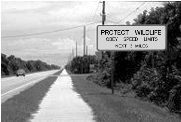
FIGURE 1 Sign just within the boundary of SISRA.

Department of Geography, University of Florida, Gainesville