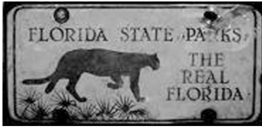
FIGURE 3 Automobile plate (FDEP).

A citizen of the Real Florida should understand, even unreflectively, that it is a 'land in balance'. 12 This conceptualization of nature drives the application of scientific research and the monitoring of the parks. Any flora or fauna tipping the scale are classified as 'unruly and unwanted guests' 13 and eradicated. Inhabiting the life-world of the Real Florida are fauna such as bottlenose dolphin, Florida panther, scrub jay, and manatee; and flora such as wire grass, longleaf pine, cabbage palm and sea grape. If they are missing, they will be returned to the land. The undesirables are: the Texas armadillo, English sparrow, Argentine fire ant and feral hog (Eurasia); and, Brazilian pepper, Chinese tallow, Japanese climbing fern and Australian pine. The FDEP acknowledges that exotic species are a 'double-edged sword' and therefore lays out specific guidelines of selectivity that distinguish the useful and beautiful from those that disrupt the 'balance of nature'. 14 'Prescribed burnings' are a common ritual used to restore harmony within the community of the Real Florida. 15