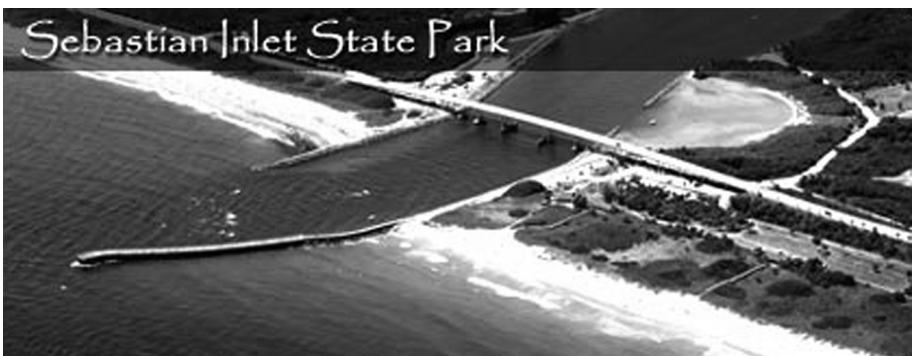
FIGURE 4 From an FDEP website, www.floridastateparks.org/sebastianinlet/default.asp

At SISRA, the third most visited state park, 16 the removal of exotics has dramatically changed the scene. The park is shaped around an inlet that during the last century has been recut several times into the barrier island that separates the Atlantic Ocean from the Indian River (Figure 4). The original reason for the incision, which is now crossed by a 1548 foot-long arch bridge, was so that local fisherman would have easy access to the Atlantic. By 1947, a permanent channel was blasted through the limestone rock