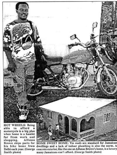
FIGURE 1 Farm worker in 'Canadian-style' clothes with motorcycle (E. Smith, 'Carpenter goes from sawing to sowing in Courtland', Simcoe Reformer , 13 Dec. 1996, p. 4)

also expresses an ideal in which bike-riding migrant workers appear as misplaced and not- belonging. This view of landscape shapes the role of foreign migrants as outsiders.