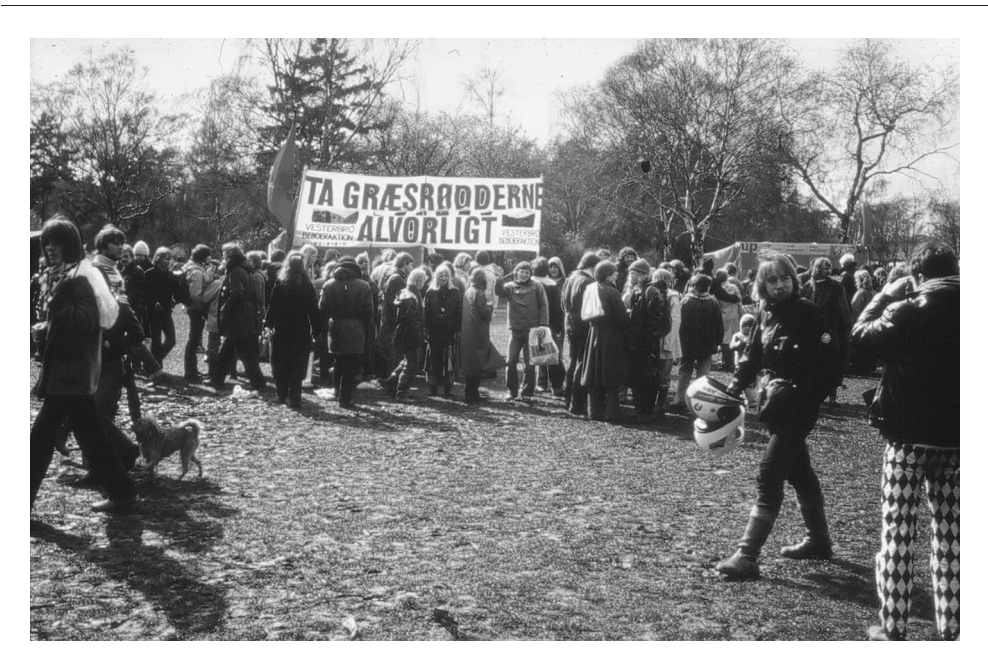
FIGURE 3 Scene from May 1 demonstration on the Copenhagen commons. The sign reads 'Take the grass roots seriously', reflecting the symbolic importance of the level swathe of leaves of grass that constitutes the commons. Unfortunately, this symbolic act of demonstrating on the green is a bit hard on its symbolic referent, the actual grass of the commons, which is being trampled into the mud.

and soggy moorlands. This movement, though controversial, mobilized a political clout which was to achieve the establishment of national parks in Britain. <sup>55</sup> The movement, however, was broader than this, and it also included less radical organizations, such as Lord Eversley's Commons, Forests and Footpaths Society (now known as the Open Spaces Society), which were able to effectively use English common law to argue for the preservation of common land as parks, particularly in urban areas. <sup>56</sup> A contemporary visitor to many of England's city parks is likely to forget that these places were once working commons; but the idea that cities and nations ought to have shared land-scapes, to which the larger citizenry has rights of access, springs from a long heritage of ideas rooted in shared rights to common land. A park of this kind is a far cry from the private landscape parks created by estate owners on what was often enclosed common land.