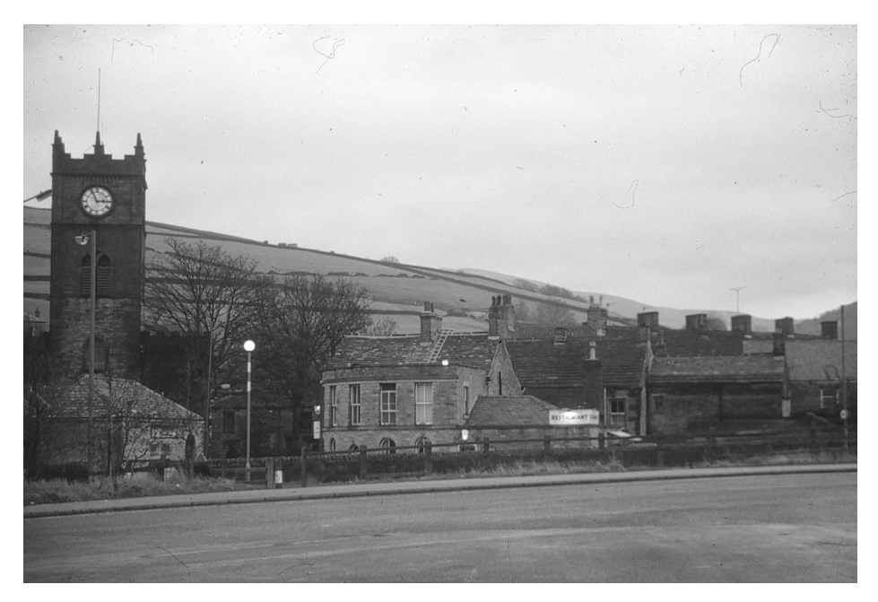
FIGURE 4 Scene of the 1932 'Kinder trespass', in which labourers demonstrated for the right of access to the English open countryside.

effectively makes one an alien, or foreigner, in the land. Alienation, however, is also a philosophical concept, with implications for the analysis of the historical role of landscape representation. Alienation is a vital theme in the tradition of the early nineteenth-century idealist philosophy of Georg Wilhelm Friedrich Hegel, in which the material being of humankind is seen to be foreign (or alien) to the ideal natural realm of pure ideas; and a century later it was revived again as a central philosophical concept. <sup>57</sup> I will largely take my point of departure in the influential work of the literary scholar and philosopher Georg Lukács, who helped spark the renewed twentieth-century interest in alienation, and whose ideas are of clear relevance to the analysis of landscape presented here.