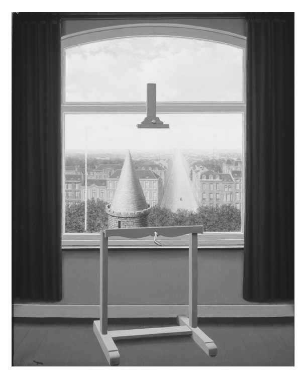
FIGURE 2 Where Euclid walked by René Magritte, 1965 (© Photothèque R. Magritte – ADAGP, Paris, 2004.)

that both the landscape on the easel and the landscape seen from the window represented in the painting are (like the pipe) not landscapes, but representations of landscape. The painting is not just a representation of a landscape however; it is the symbolic representation of the idea of landscape as an expression of an ideal geometric archetype. The painting has a subtext, which reads 'Where Euclid walked', and if we look closely we see that the tower of a building has the same Euclidean shape as the boulevard that stretches from the window out to the horizon. The painting is thus not just a representation of landscape, but a representation of the way a perspective representation of landscape is generated through the use of Euclidian geometry as framed by a square window.