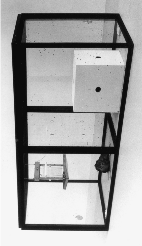
FIGURE 3 A thousand years