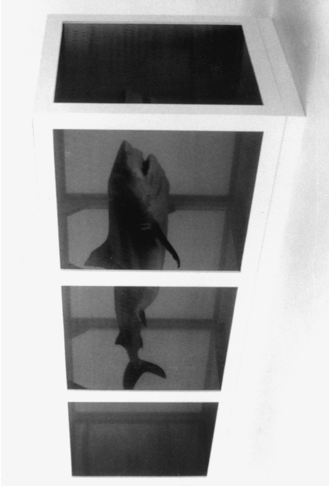
FIGURE 2 The physical impossibility of death in the mind of someone living (reproduced by kind permission of the Saatchi Gallery, London)