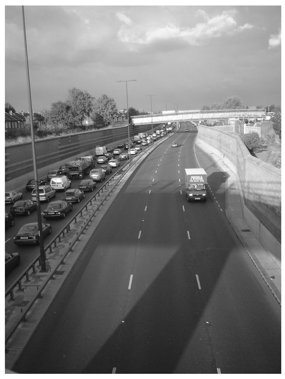
FIGURE 2. 'I know that if my house was still there, it would be hanging in space above the inside northbound lane.' View of the M11 link road from the Linked route.