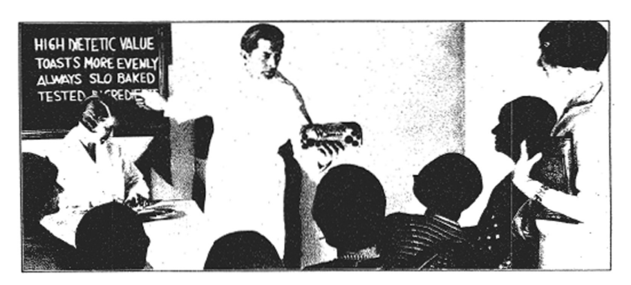
FIGURE 1 A lab-coated scientist explains the benefits of Wonder Bread to a gathering of well-dressed women in this ad from 1929. The title reads: 'Mothers here adopt new bread. Widely urged for school children.' New York Times 14 April 1929, p. 104.

price, bread advertising touted purity and hygiene. Scientific baking promised to deliver perfectly hygienic bread – untouched by human hands from dough to dinner table. In doing this, the baking industry turned the binary of purity and contagion on its head: thanks to the techno-scientific control they exercised over bread, industrial bakers argued, it was homemade (read: dirty and dangerously inconsistent) bread that posed a safety threat. In order to credibly make this claim, baking had to be entirely repositioned in the minds of consumers, and this repositioning can only be understood by examining the professionalization of baking.