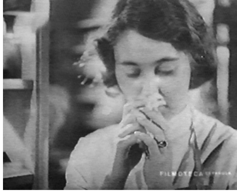
Figure 4. NO-DO 35-A, 1943.