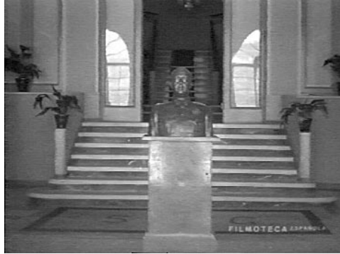
Figure 2. NO-DO 321-B, 1949.