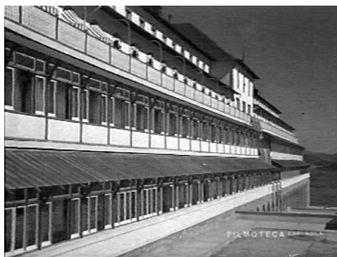
Figure 1. NO-DO 321-B, 1949.

The dictator was present at half of the 52 inaugurations covered by NO-DO between 1943 and 1970. 21 The selection of locations for his appearance does not appear to have been random. In the aftermath of the Civil War, Franco seemed particularly active in the Basque Country, which had an especially damaged relationship with the “Spanish” national identity,