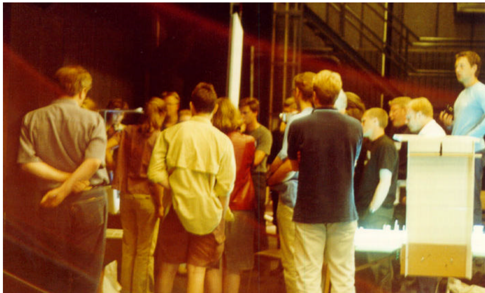
The participants during hands-on experiences

The workshop started with a short introduction, explaining the aim and program of the workshop and giving some background of the three organisers. After this a longer time slot was allocated to an introductory round for the participants. We asked people to tell their names, to explain their connection to and/or research experience with tangible interfaces, and to tell the group what they hoped to take home from this workshop, any existing questions and hypothesis concerning tangible interfaces, and what they believe to be design issues.