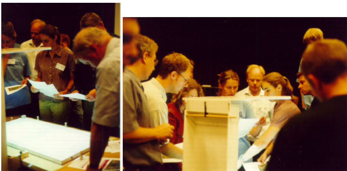
The participants starting with the role-play on the PitA-Board, reading persona descriptions and during interaction

The PitA-Board was briefly introduced by Hal Eden. He also presented a use scenario that described the inhabitants of a neighbourhood being asked to collaborate in making a proposal for an improved bus route through their neighbourhood. The system consists of a white, gridded board, showing the neighbourhood and a top-down projection. Volunteers were recruited for the role-play and were given the tangible tokens and role-sheets, describing the personas they were to play. The tokens were made from wood, resembling large-sized board-game person figurines. In addition, there were bus stops, a wooden vehicle for creating busses, and several square tokens for various functions (drawing bus route, deleting, questioning). The system senses the tokens, when placed on the gridded squares of the board. The remaining participants were watching the interaction. Portions of the role-play scenario were played through, short-cutting at several points in order to give participants an overview of the interaction possibilities and features of the system. For more information on the system see: (Arias et al 1997, Hornecker, Eden, Scharff, 2002, and Eden, Hornecker, Scharff, 2002).