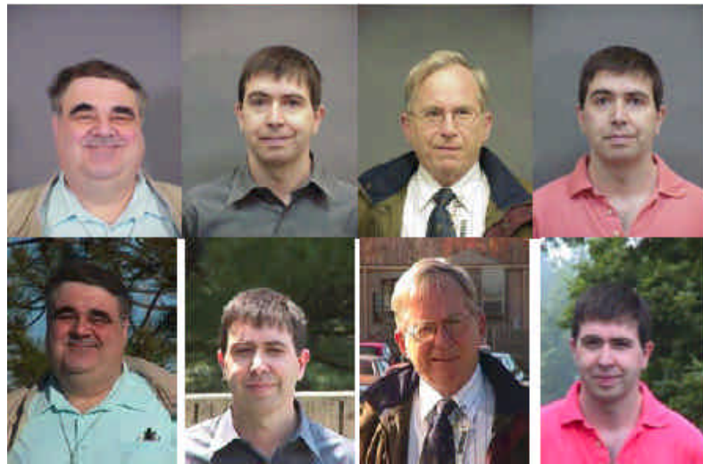
Figure 2: Indoor and outdoor images from the medium data base.

The medium size database consisted of a number outdoor and video images from various sources. Figure 2 below gives an indication of the images in the database. The top row contains images taken indoors and the bottom contains outdoor images taken on the same day. Notice the quality of the outdoor images. The face is consistently located in the frame and similar in orientation to the indoor images.