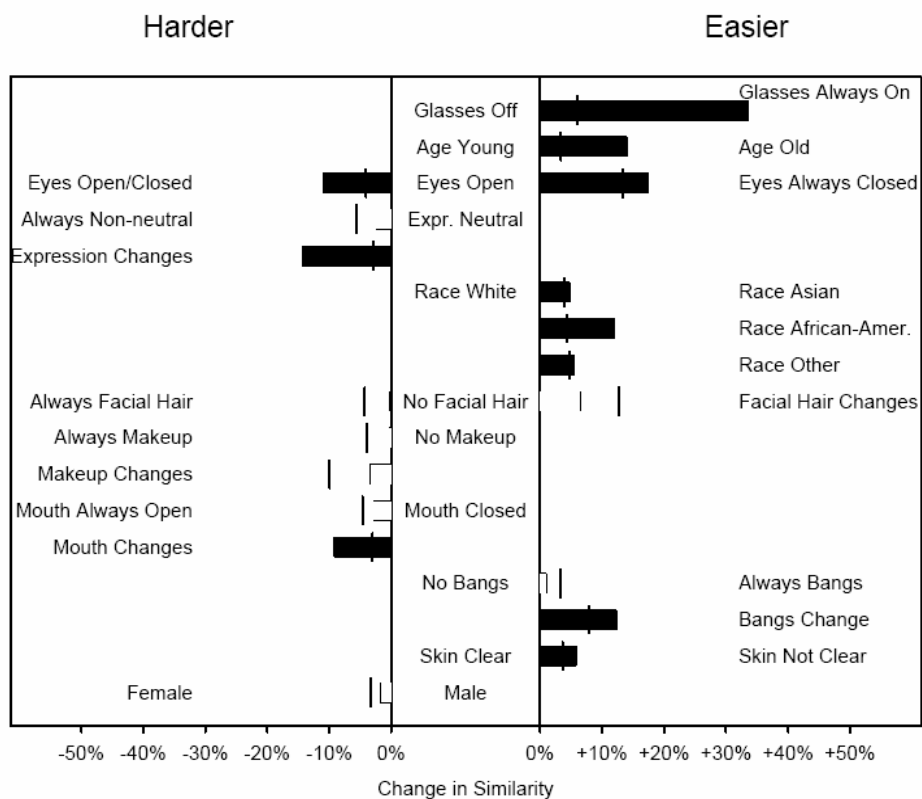
Figure 4: Factors making it harder or easier to correctly identify a probe image presented to a system

The most surprising outcome – for those involved – of the FRVT 2002 is the realization that the algorithms displayed particular identification biases. First, recognition rates for males were higher than females. For the top systems, identification rates for males were 6% to 9% points higher than that of females. For the best system, identification performance on males was 78% and for females was 79%. Second, recognition rates for older people were higher than younger people. For 18 to 22 year olds the average identification rate for the top systems was 62%, and for 38 to 42 year olds was 74%. For every ten years increase in age, on average performance increases approximately 5% through age 63. Unfortunately they could not check race as the large data set consisted of mostly Mexican non-immigrant visa applicants. However, research by Givens et al. (2003), using PCA algorithms, has confirmed the biases in the FRVT 2002 (except for the gender bias) and also found a significant race bias. This was confirmed using balanced databases and controlling for other factors. They concluded that: “Asians are easier [to recognize] than whites, African-Americans are easier than whites, other race members are easier than whites, old people are easier than young people, other skin people are easier to recognize than clear skin people...” (8). Their results are indicated in Figure 4 below.