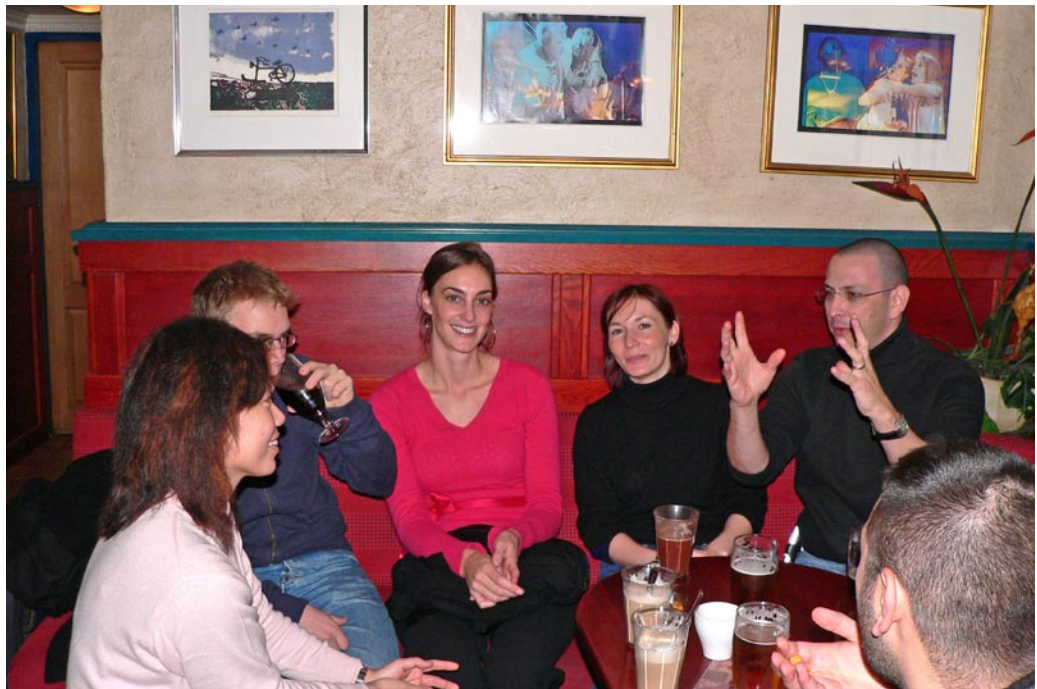
The International Forum on Strategic Thinking at its best – socializing, networking and making friends