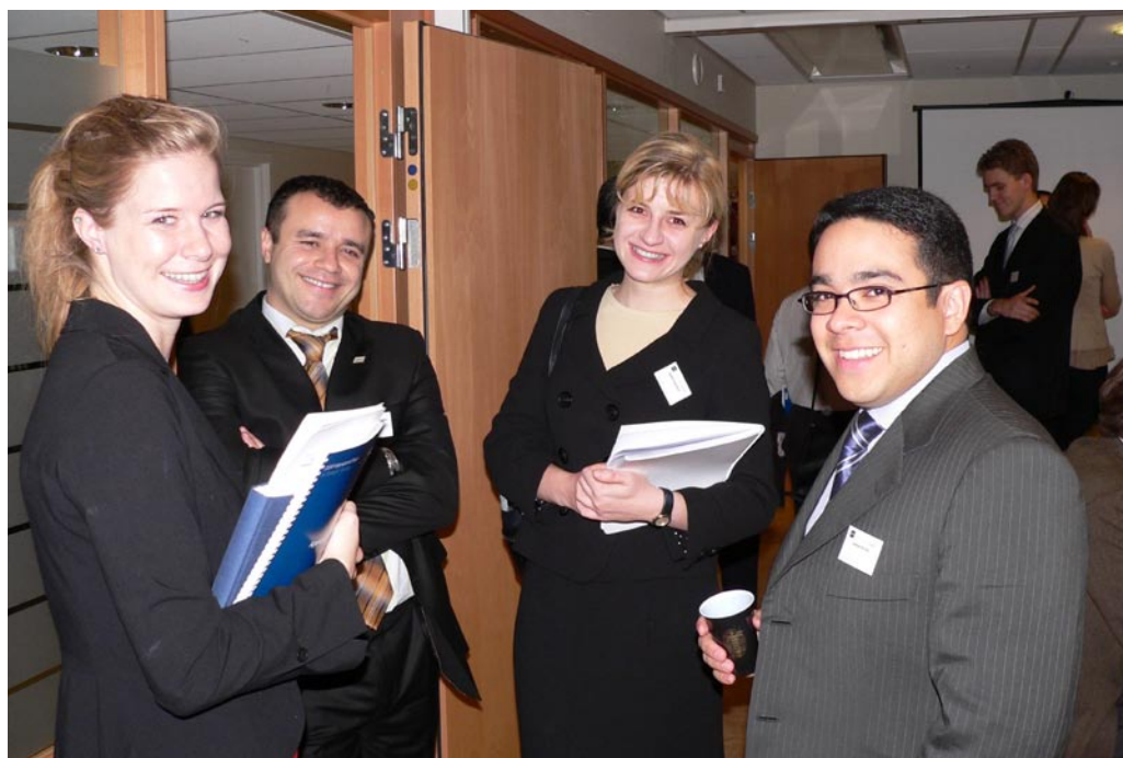
Discussions continue well into the coffee breaks