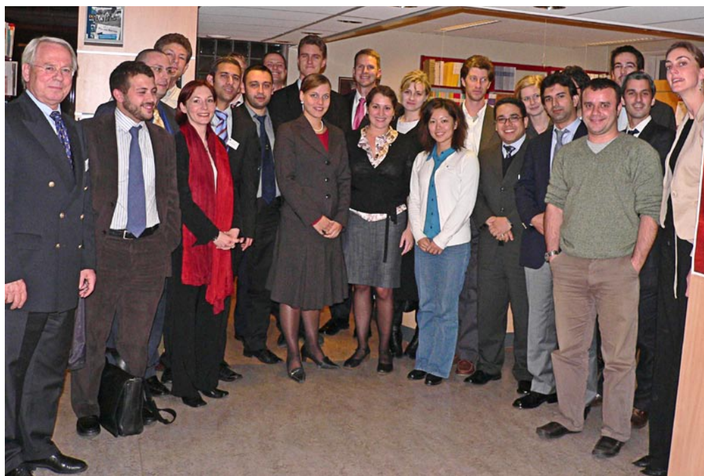
Participants of the 9th New Faces Conference gather at NUPI