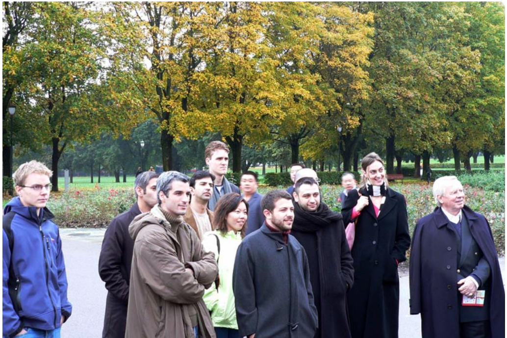
During a stroll through the Vigeland Sculpture Park