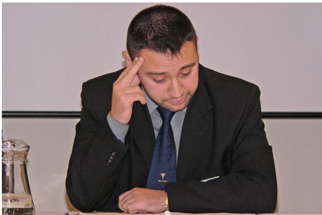
Mehmet Tezcan elaborating on Turkey's foreign energy policy