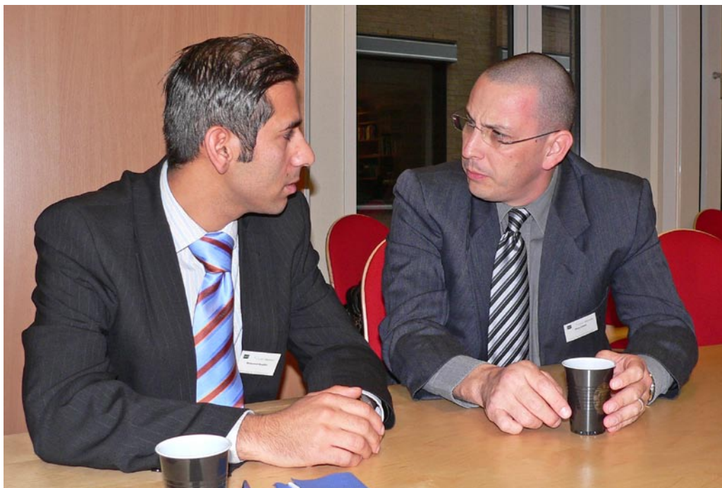
Israeli-Palestinian encounter and dialogue during the NFC