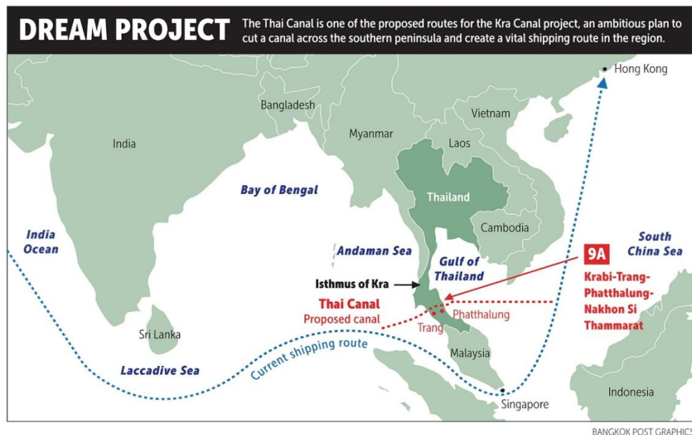
Figure 1: The Hypothetical Thai Canal

The fact that both the US and India enjoy a strategic advantage over China in the Strait of Malacca has persuaded Beijing to explore other options for an alternative. China has taken several initiatives to ensure its maritime security. One proposal has been the creation of the Thai channel. This hypothetical canal is along China's most ambitious infrastructure and a regional project dubbed the Maritime Silk Road. This controversial canal will be built south of Thailand's Kra Isthmus - the narrowest point of the Malay Peninsula - which could become China's second gateway to the Indian Ocean. As Figure 1 shows, the canal will enable China's navy to move its ships between its newly established base in the South China Sea and the Indian Ocean without traveling the 700-mile route south to bypass Malaysia (Foreign Policy 2020). The Thai government has yet to conclude China's construction of this canal. In February 2018, Thailand's Prime Minister Prayut Chan-o-cha declared that the canal was not a government priority (Strait Times 2018). However, on 16 January 2020, the Thai House of Representatives agreed to set up a committee to study the Thai Canal project (Bangkok Post 2020). Nevertheless, if it is built, China's geopolitical privileges in the Indian Ocean will increase in disadvantage of India.