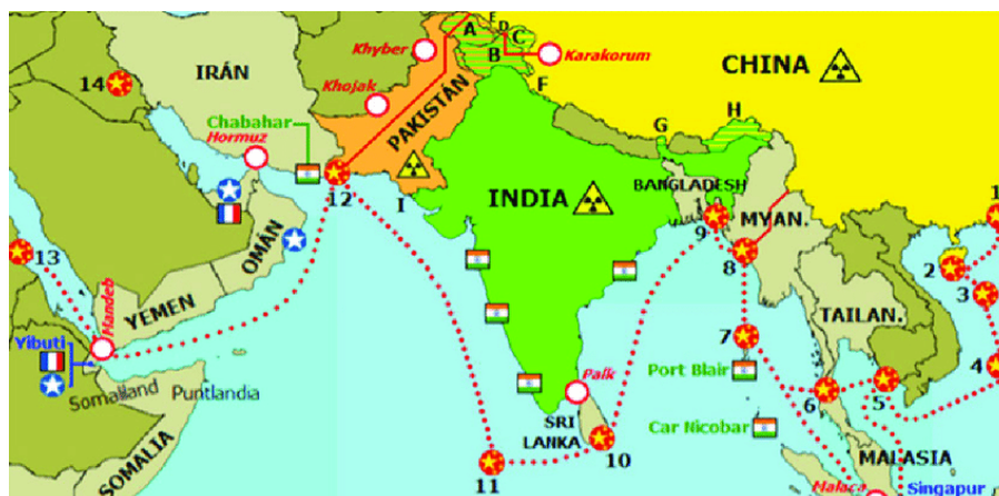
Figure 2: China's String of Pearls Strategy