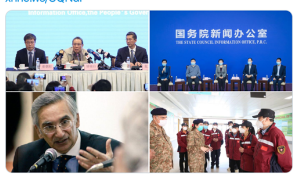
5:06 AM · Apr 9. 2020 · China Xinhua News

China's responses to #COVID19 in terms of providing timely information and international assistance have greatly helped the world to combat the major public health emergency, says a Pakistani former ambassador xhne.ws/UQNdI