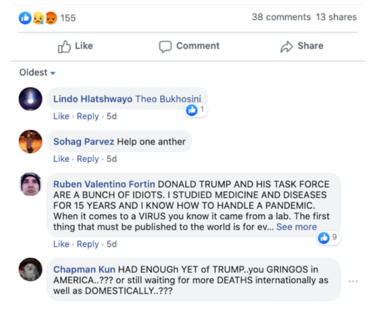
Figure 8. Screenshot of some of the responses to the post in Figure 4.