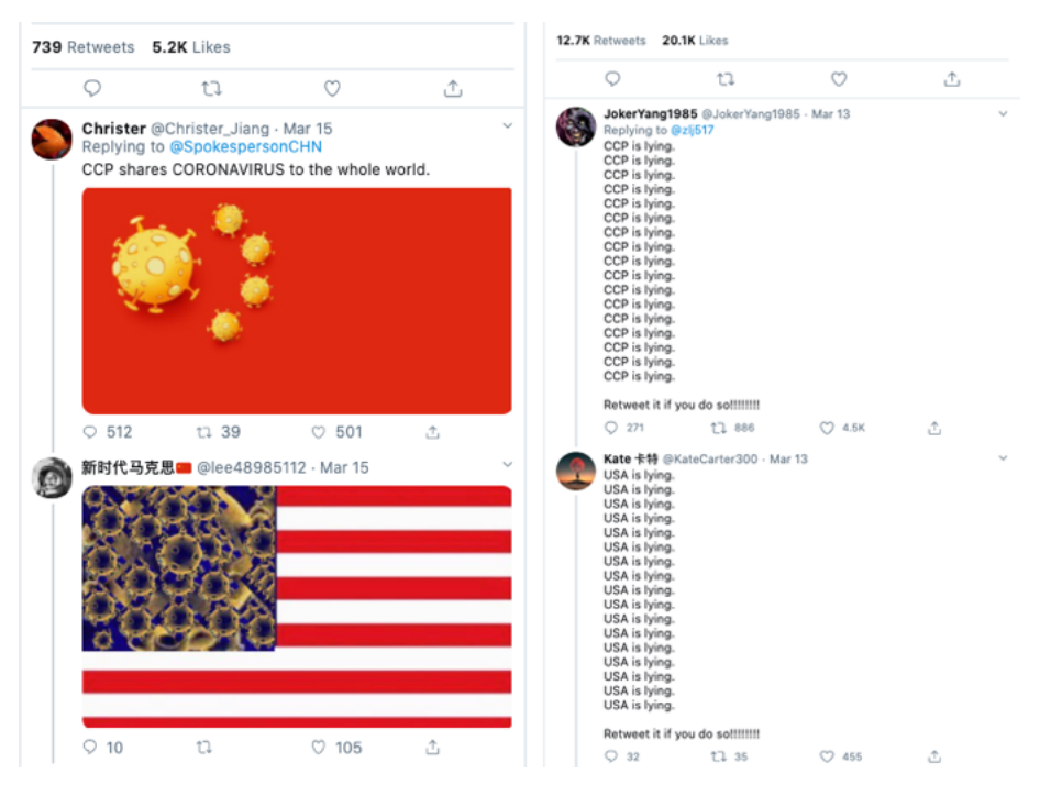
Figure 9. Screenshots of some of the responses to the posts in Figures 2 (left) and 5 (right). Sources: Hua (2020) and L. Zhao (2020).

mixed responses to social media users. Audiences' attention may be deflected from the real health and science problems in the pandemic, for which China shoulders global responsibilities, and the transforming international politics, on which China is exerting influence. Advanced computational approaches to social media interactions, as well as global public opinion polls, are helpful for clarifying global publics' perceptions of China and international relations and politics.