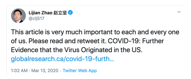
Figure 5. Screenshot of @zlj517's tweet.

Moreover, the tit-for-tat narrative was further ignited when China's Foreign Ministry Spokesperson Zhao Lijian urged people to read a poorly verified article which claims that Covid-19 originated in the US (Figure 5). While scientists are still on the way to figure out the origin of the virus, this tweet by one of China's most important state actors further muddled the water of the health and science controversies emerged from this pandemic.