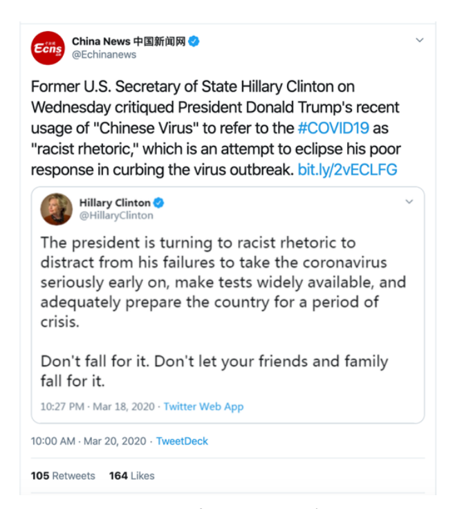
Figure 3. Screenshot of @Echinanews' tweet.

In constructing a negative "US," China's state actors have also been applying a myriad of information strategies. Firstly, their social media accounts highlighted what is negative about the US, especially the US's irresponsible actions to tackle the pandemic. For example, Figure 4 shows that CGTN America indicated the hinderance caused by the US's trade restrictions on China's efforts in providing assistance overseas. What makes this tweet interesting is that CGTN America mixed US's irresponsibility during the pandemic with the prolonged trade war between China and the US, which cemented the accusation of the US in dealing with major global issues.