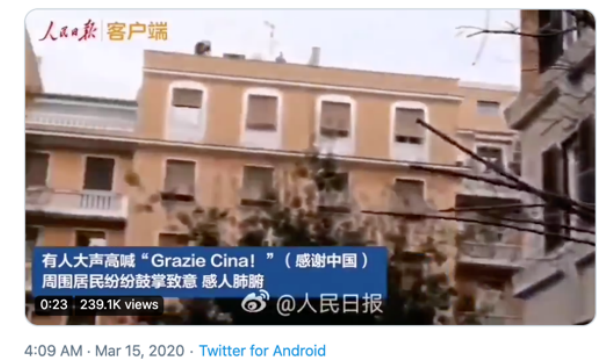
Figure 2. Screenshot of @SpokespersonCHN's tweet.

Amid the Chinese anthem playing out in Rome, Italians chanted "Grazie, Cina!". In this community with a shared future, we share weal and woe together.