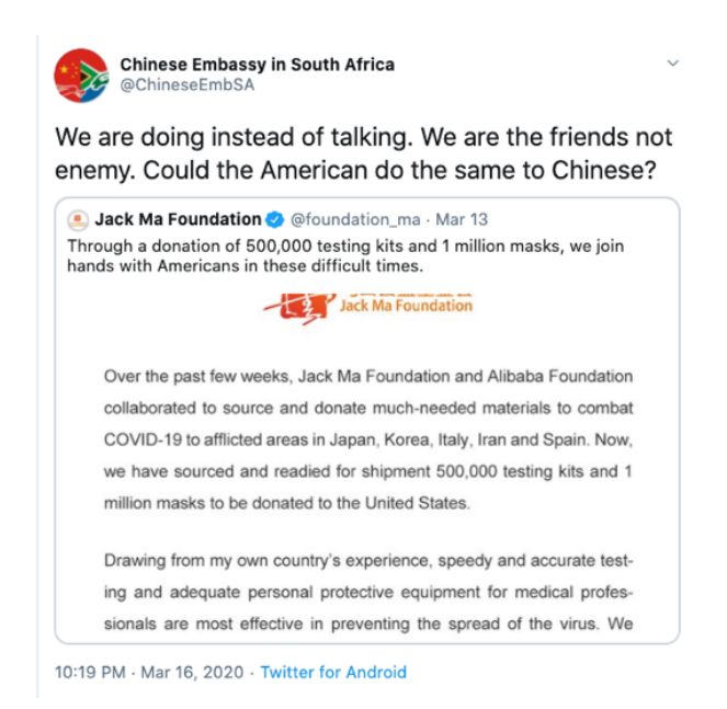
Figure 6. Screenshot of @ChineseEmbSA's tweet.

Secondly, China's state actors requested the US to behave responsibly and benevolently (Figure 6). A combination of factual information in the original tweet by Jack Ma Foundation and the opinion by Chinese Embassy in South Africa solidified the image of an inactive "US."