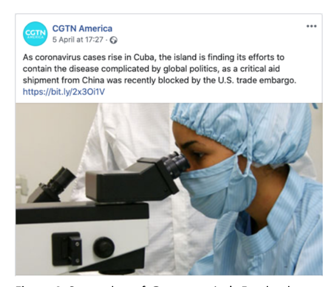
Figure 4. Screenshot of @cgtnamerica's Facebook post.

In constructing a negative "US," China's state actors have also been applying a myriad of information strategies. Firstly, their social media accounts highlighted what is negative about the US, especially the US's irresponsible actions to tackle the pandemic. For example, Figure 4 shows that CGTN America indicated the hinderance caused by the US's trade restrictions on China's efforts in providing assistance overseas. What makes this tweet interesting is that CGTN America mixed US's irresponsibility during the pandemic with the prolonged trade war between China and the US, which cemented the accusation of the US in dealing with major global issues.