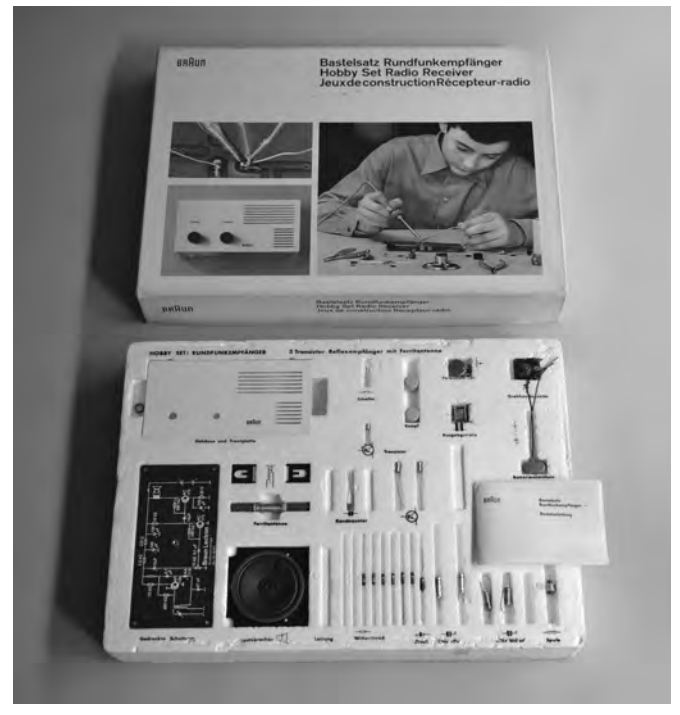
[Figure 2.1] The Hobby Set Radio Receiver design by Dieter Rams and Jürgen Greubel, 1967.

the technically interested and capable teenager. Contemporary flat design, on the other hand, incorporates design elements for a much younger age group. Its colorful surfaces, big typography, and animated characters are generally design elements used for targeting children aged two to seven—a time during which children are in the sensorimotor stage. Children in this stage, as the child psychologist Jean Piaget has shown, assign active roles to things in their environment (animism), while their activities are mainly categorized by symbolic play and manipulating symbols. It is a stage in