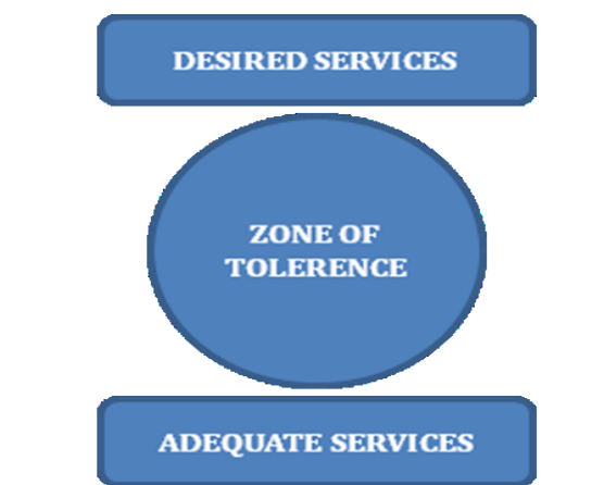
Figure 2. Zone of tolerance.

This is most critical time in hospital services since Services are heterogeneous i.e. performance of hospitals may vary across providers, across employees of same provider. The extent to which customer recognizes and are willing to accept this variation, is called Zone of tolerance. It is the range where customer does not particularly notice service performance of your hospitals. Hospital administration must try to perform better than the best during this time period. It generates customer loyalty, footfall, brand image and profit maximization.