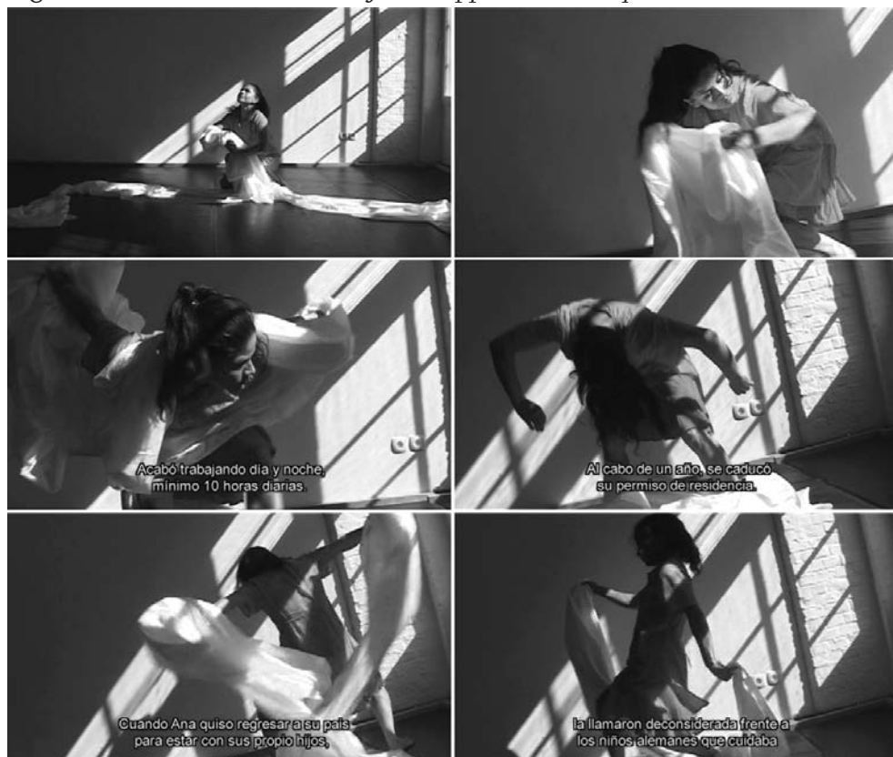
Figure 6: Mit einem Lächeln auf den Lippen , Germany, 2008