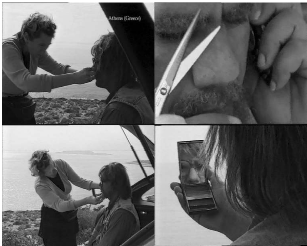
Figure 5: Passagères clandestines , Belgium/France, 2004