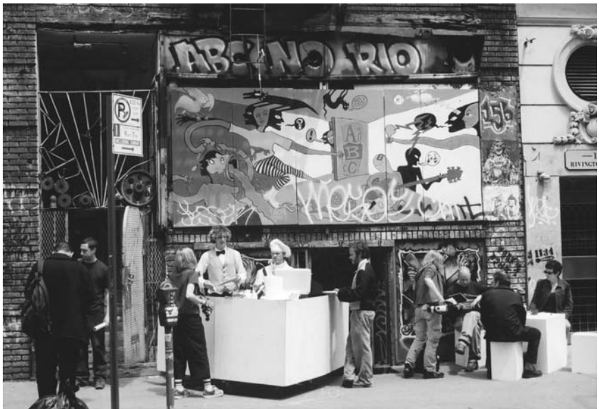
FIGURE 4 ABC No Rio, venue for the Psy-geo-conflux in May 2003, with mobile Nomadic Café by the Providence Initiative for Psychogeographical Studies.