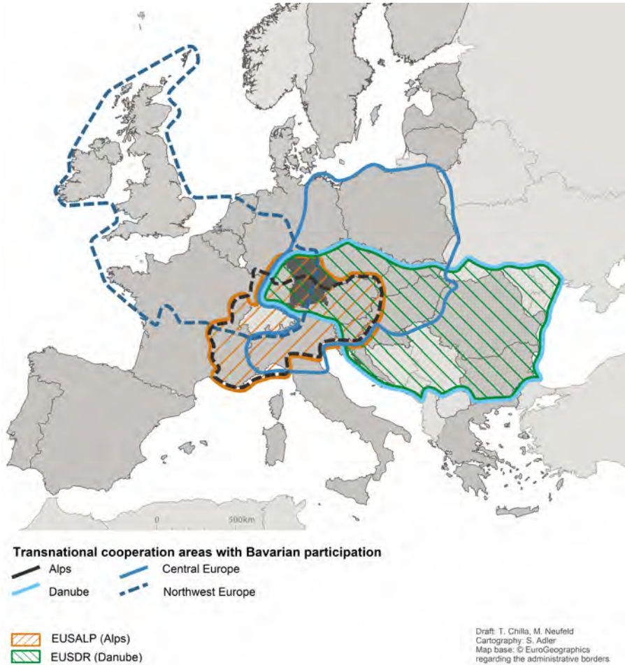
Fig. 2: Bavaria's participation in transnational cooperation areas and macro-regional strategies

This finding, which in principle reflects the situation on all the inner-European borders, is discussed in the conceptual debate under Rescaling and Reterritorialisation. The emergence and transformation of cross-border cooperation forms and regions is always an expression of political interests (Paasi/Zimmerbauer 2016). These new spaces of activity offer actors the opportunity to get involved in agenda setting on the levels above and below them. The potentials of this for the metropolitan level are discussed in the article by Raymond Saller in this volume.