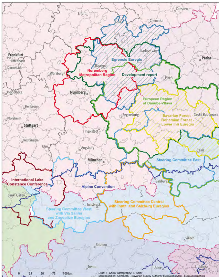
Fig. 1: Overview of the most significant forms of cross-border cooperation on the Bavarian border