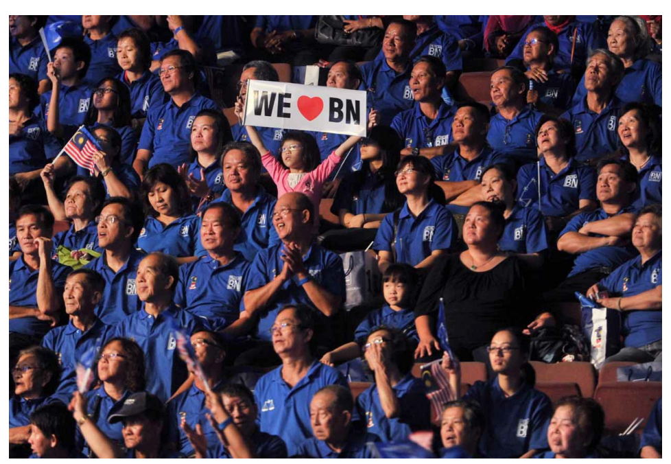
Figure 2. A young Barisan Nasional supporter responds to an address by BN chairman Datuk Seri Najib Tun Razak during an election rally at a stadium in Bukit Jalil on April 6, 2013.

In the 1950s and 1960s, UMNO was weakly institutionalized and was not able to mobilize large amounts of funding. The Alliance coalition's electoral campaigning was to a large extent financed by the much smaller MCA. But UMNO grew increasingly stronger and has clearly dominated party politics at least since the early 1970s, when it began establishing its own business conglomerate. Thereafter, the state apparatus began, in many cases, to become almost identical with UMNO.