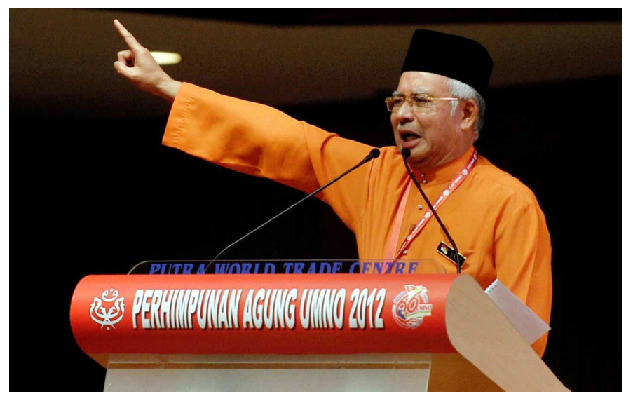
Figure 3. Datuk Seri Najib Razak, president of the United Malays National Organisation, addresses a UMNO General Assembly in Kuala Lumpur, 1 December 2012.

The logic of minimizing competition and costs does not, however, apply to contests for positions within the ruling parties themselves. The rise of businessmen within UMNO has been accompanied by the commercialization of intraparty elections. This commercialization was amplified in 1984 when the deputy president was elected for the first time. This decision to allow for voting unleashed vote buying in the general assembly, with more than RM20 million spent on the practice in the 1984 election. In 1990, bonus votes and a quota system were introduced to weaken the power of the ordinary delegates. However, this did not have the expected results, and in the 1993 contest for the post of deputy president, when Anwar Ibrahim beat Ghafar Baba, RM200–RM300 million were reputedly handed out by one faction alone.<sup>29</sup> Although money politics were forbidden and new sanctions for infringements were announced in 1994, it is an open secret that even today only rich people can rise to top leadership positions. According to Mahathir, "practically everyone who was elected to the [UMNO] Supreme Council in 2009 won because they used money."<sup>30</sup>