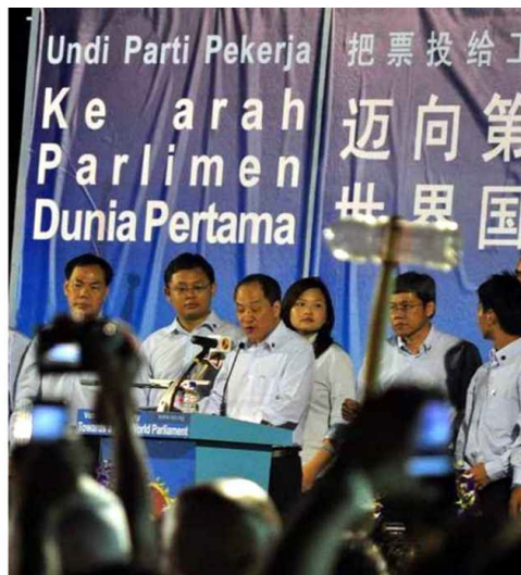
Figure 1. Elections in Malaysia and Singapore. (L) Opposition People's Justice Party candidate Rafizi Ramli shakes hands with supporters during a parliamentary election campaign stop in April 2013. (R) Secretary-General of the Workers' Party of Singapore Low Thia Khiang addresses a party rally prior to Singapore's general election in 2011.