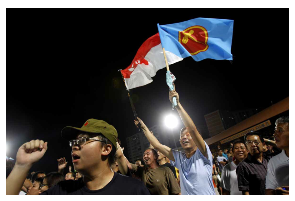
Figure 6. A Worker's Party supporter waves the national flag of Singapore (left) and the Worker's Party flag (right) as opposition party members awaited election results in Singapore on 7 May 2011.

to various cronies, but was trapped later because the business empire had to be hidden from the public eye. Over time, however, UMNO's business became an open secret and compromised the whole party. At least since the 1980s, the opposition in Malaysia has criticized UMNO as a corrupt party of "UMNOputeras." Money politics characterizes not only its financing, but also the internal competition for party posts. The PAP, in contrast, is a cadre party and its role within the regime is subdued. The selection of cadres is opaque but in all likelihood free from money politics. Only during campaigning does the machinery come to life. Party administration and electioneering is relatively inexpensive, and elections are won with the help of the extremely strong state administration, which includes powerful state-owned companies. The PAP itself does not own huge enterprises. Strict regulations and the effective control of corruption guarantee an electoral process that is relatively clean. The party financing regime serves to circumscribe the extent of political competition and to strangle opposition parties (Figure 6).