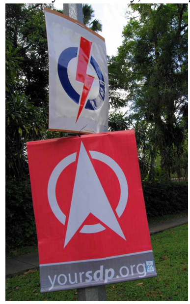
Figure 4. Posters of the People's Action Party (top) and Singapore Democratic Party (bottom) hang from a lamppost on Clementi Road in Holland–Bukit Timah GRC during the 2011 general election in Singapore.

Since the early 1960s, Singapore has been transformed into an "administrative state" in which party and state are hardly distinguishable, as Ian Austin observes. The state "consist[s] of politicians and a selected elite bureaucracy-intelligentsia, who themselves often enter politics through the PAP, this elite apparatchik defines what is in the best interest of the Singapore citizen." The bureaucracy, Ho Khai Leong notes, infiltrates "almost every aspect of [a] citizen's life." However, the relationship between the state apparatus and the PAP is difficult to describe. For Natasha Hamilton-Hart, the administration "has remained entirely subordinate to the political leadership. Individual bureaucrats occupy important roles but they are integrated into a wider system of government which does not support bureaucratic centres of power." According to Anthony Cheung, this developmental state, "Singapore, Inc.," has "acted as the centre of a tightly directed network of strategic linkages with politics, bureaucracy, economy and society, creating an all-sectors-in-one configuration." Hamilton-Hart argues that